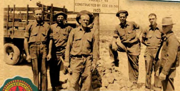
CCC "boys" pose with their newly built road.