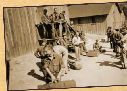
Moving in day!

Established in 1935 as a model camp in the Fort Missoula District, Birch Creek operated from 1935 to 1941 under the U.S. Army, in partnership with the Forest Service. At its peak, 200 men bustled among its 15 permanent buildings. The pot belly stoves were popular features in the winter when temperatures could plummet to minus 32 degrees.