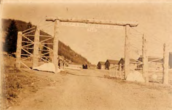
This gate welcomed new Birch Creek enrollees.