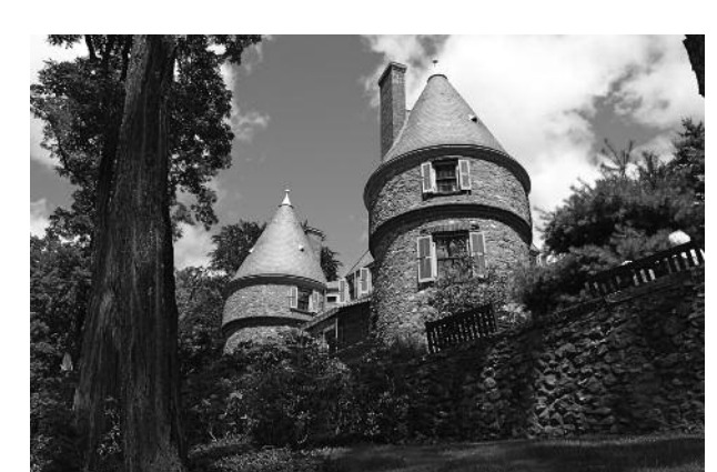
Grey Towers, Old Owego Turnpike, Milford, PA