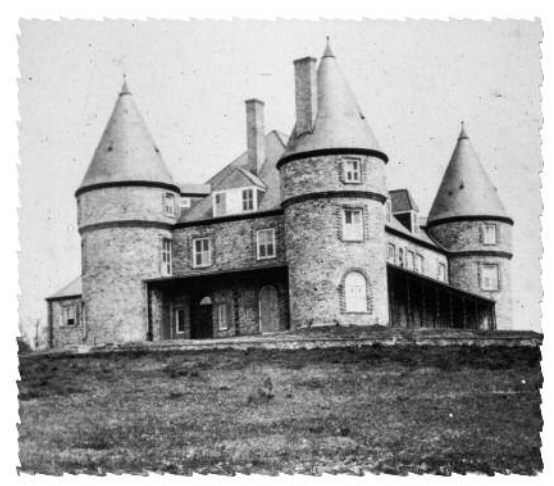
Grey Towers circa 1886

While there are many interesting and unique historic structures in Milford, PA, this walk focuses on the leadership, influence and contributions of one family: The Pinchots .