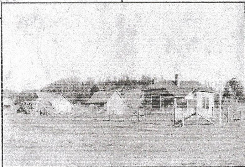
Rager Ranger Station 1933