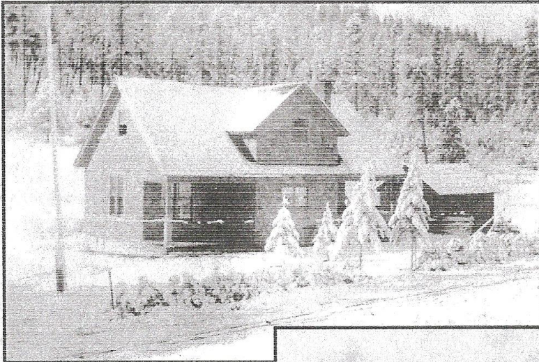
Maury Ranger Station 1930's