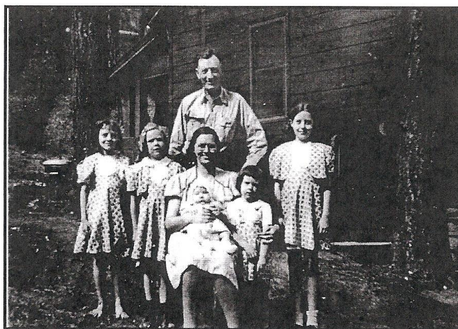
Houston Family at Ochoco Ranger Station 1943