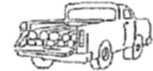
1/3 Cord (short bed)