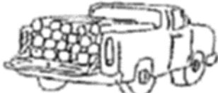
1/2 Cord (short bed)