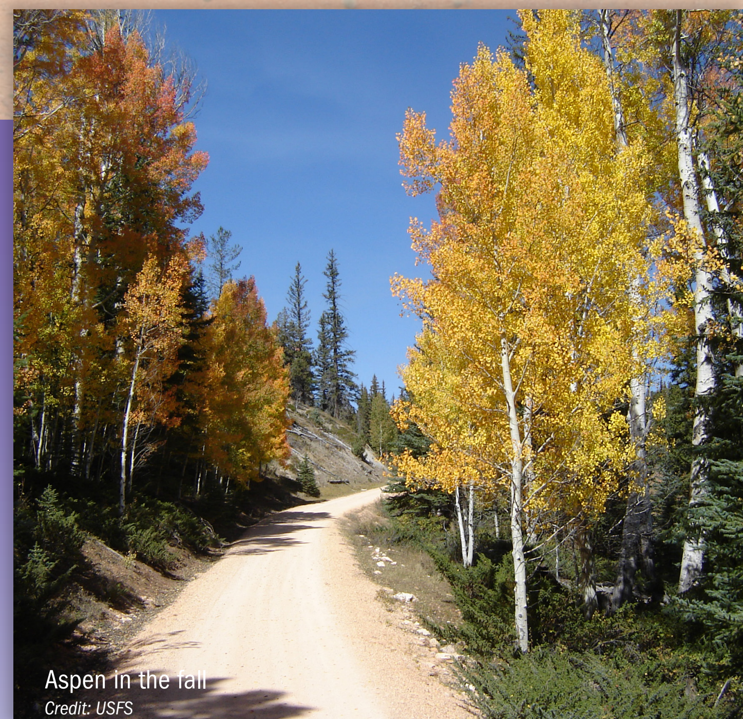
Aspen in the fall