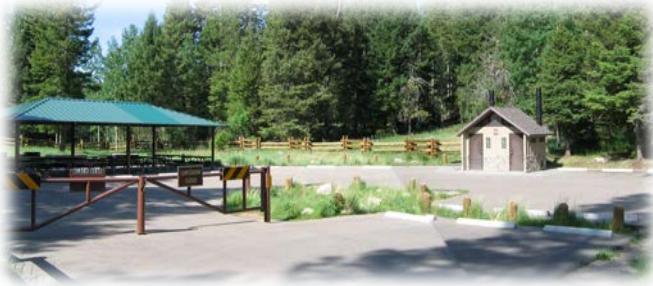
Figure 1: Black Bear Group Campground

All campgrounds are accessible via US and/or State highways along with paved Forest Service Roads. For details of access to each unit please refer to the map on page 2 of this guide.