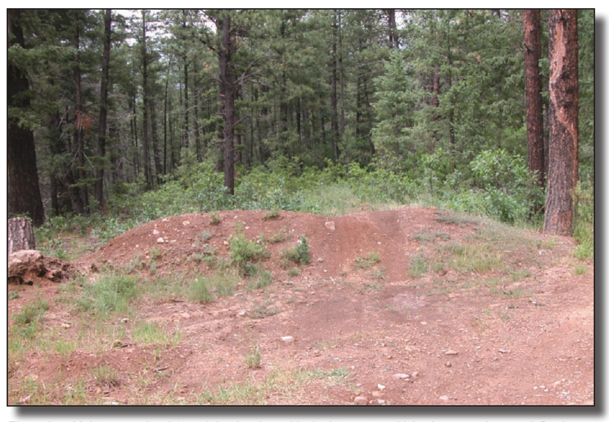
Figure 24—Maintenance level 1 road that has been blocked to motor vehicles by an earth mound. Design closure features to avoid creating hidden hazards to users, such as snowmobilers and bicyclists. An example of a hidden hazard is deep trenching behind the earth mound.