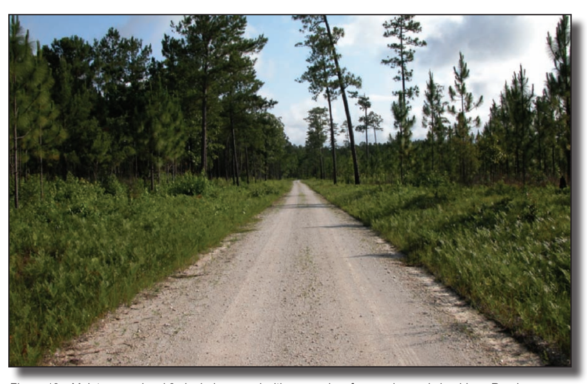
Figure 12—Maintenance level 3 single-lane road with a gravel surface and gravel shoulders. Road surface should be maintained to provide adequate drainage and to provide for travel by prudent drivers in standard passenger cars and not to increase the user comfort and convenience above that expected for a maintenance level 3 road. User comfort and convenience are not considered priorities. The base course and surfacing should be replaced as needed to protect the resource.