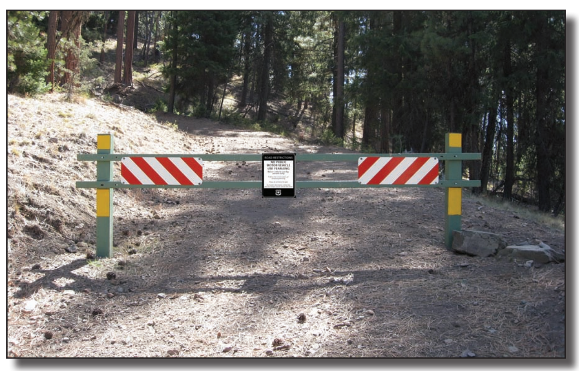
Figure 30 - Maintenance level 1 road with motor vehicle use restricted by a barricade. The road is closed to all motor vehicle use, including administrative use, for a period of more than 1 year. Gates are not appropriate on level 1 roads. Appropriate travel management signs may be placed on the barricade to display restrictions and/or reasons for closures. If motorized or nonmotorized use, such as bicycles, occurs behind a barrier, the back side also will require signing.