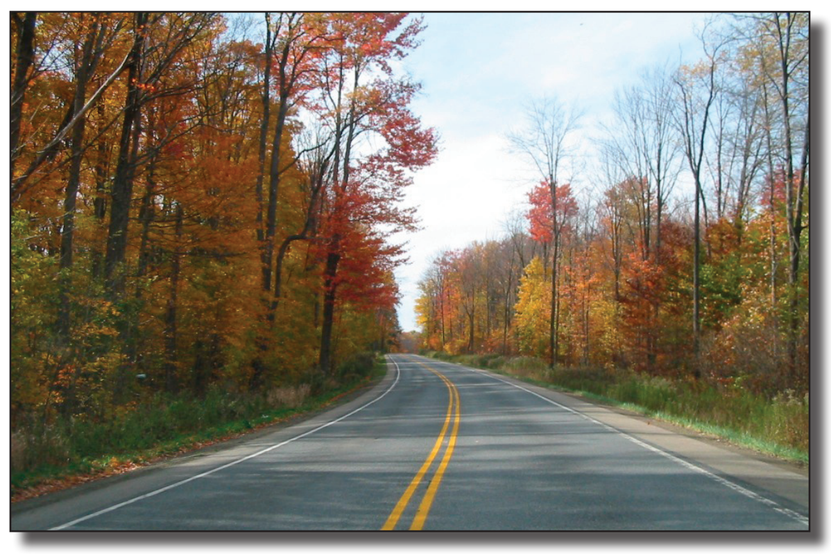
Figure 4—Maintenance level 5 double-lane road with no-passing zone and edge markings, an asphalt surface, and asphalt shoulders. The road is free of litter and the maintenance of the roadside vegetation provides adequate sight distance. Remove danger trees as required. It is acceptable to mark a double-lane road entirely with no-passing zone markings as shown in the photo.