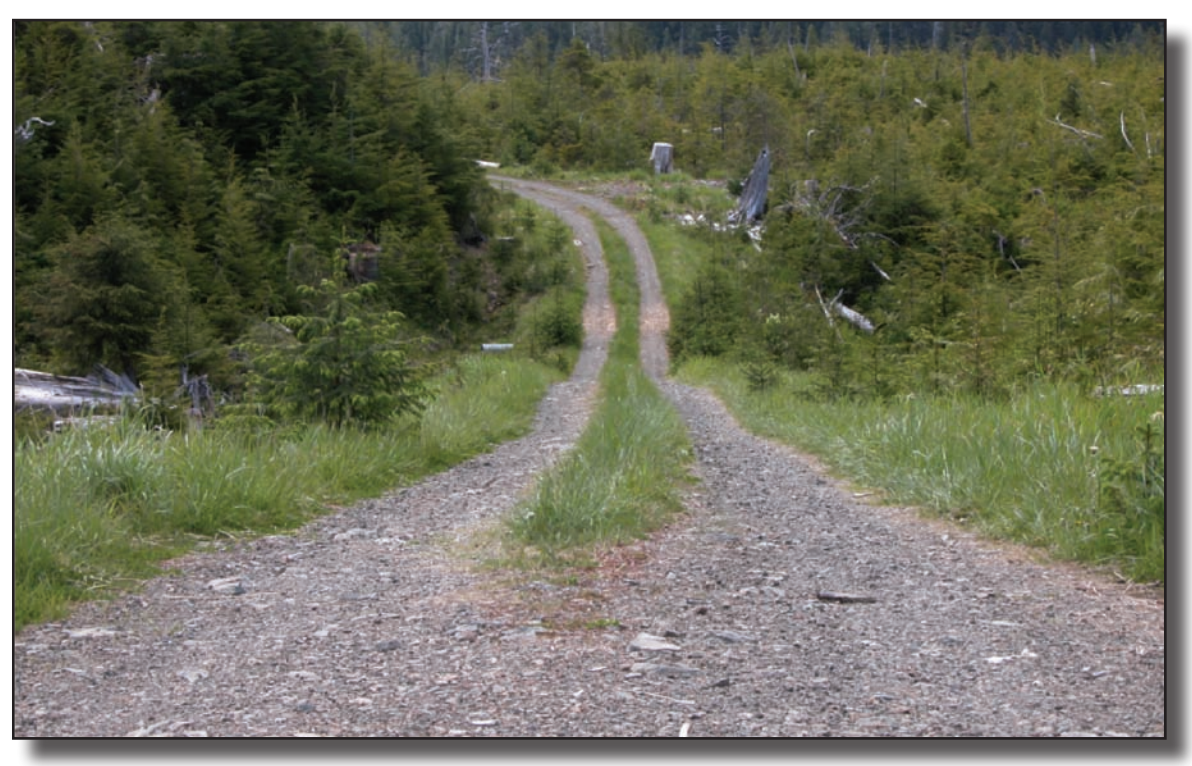
Figure 17—Maintenance level 3 single-lane road with a gravel surface and no shoulders. Maintain road surface to provide adequate drainage. Surface roughness is acceptable if maintained for travel by a prudent driver in a standard passenger car. Remove berms and vegetation from the middle of the road that would impede travel by a prudent driver in a standard passenger car. Maintain drainage facilities, such as culverts and drainage pipes, so they are functional and prevent unacceptable environmental and resource damage.