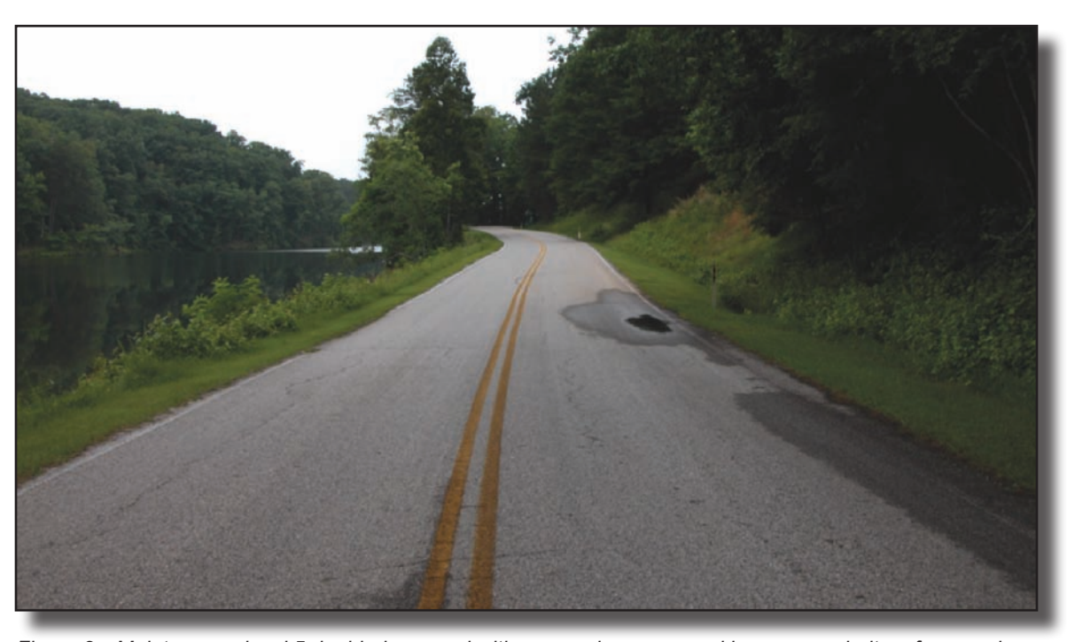
Figure 2—Maintenance level 5 double-lane road with no-passing zone markings, an asphalt surface, and unpaved shoulders. Grass on shoulders is acceptable and helps with stabilization. Leaving vegetation that does not interfere with sight distance helps stabilize the backslope. As potholes and depressions begin to develop they should be corrected to continue providing a high degree of user comfort and convenience. Curves and other hazards should be marked with warning signs if advised by a documented engineering judgment or engineering study. It is acceptable to mark a double-lane road entirely with no-passing zone markings as shown in the photo.