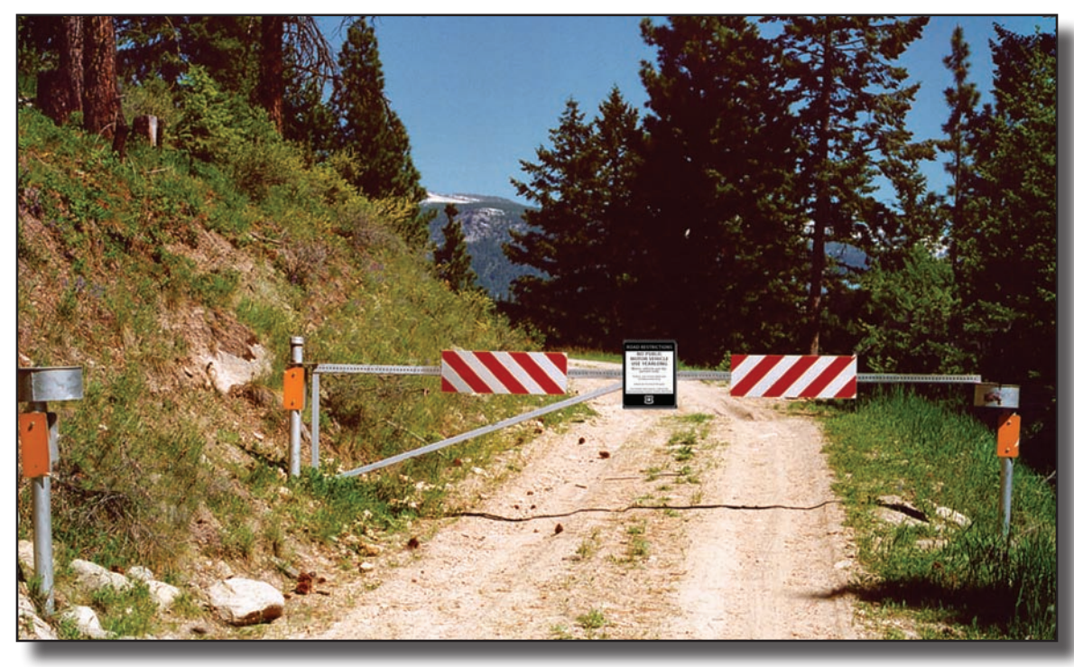
Figure 23—Maintenance level 2 single-lane road with native surfacing that has motor vehicle use restricted by a gate. The surface and shoulders of this maintenance level 2 road are adequate for access by high-clearance vehicles at low speeds, and there is no evidence of significant environmental damage. A gate is an appropriate closure devise for maintenance level 2 roads that temporarily restrict all motor vehicle use or that are managed as administrative use only roads. If motorized or nonmotorized use, such as bicycles, occurs behind a gate, the back side may require signing also.