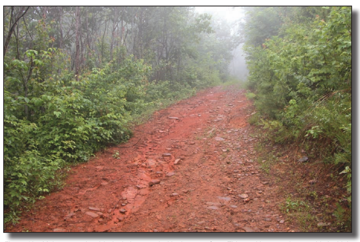
Figure 18—Maintenance level 2 single-lane road with pit-run surface. This road is currently passable by high-clearance vehicles at low speeds and there is no evidence of significant erosion. No immediate maintenance is needed and future surface and shoulder maintenance activities should be limited to maintaining passage by high-clearance vehicles and to keep drainage features functional.