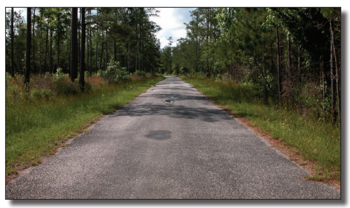
Figure 10—Maintenance level 4 single-lane road with a chip-seal surface and ditches. Potholes and depressions should be monitored and repaired before they adversely affect the user's comfort and/or convenience expected on a maintenance level 4 road. The ditches in this photo are beginning to become overgrown with vegetation, and they should be maintained properly to facilitate drainage. The road is free of litter, and the maintenance of the roadside vegetation provides adequate sight distance. Curves and other hazards should be marked with warning signs if advised by a documented engineering judgment or engineering study.