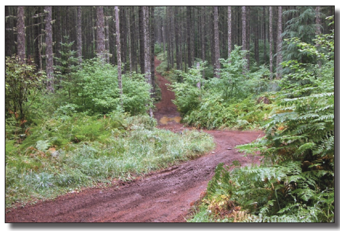
Figure 19—Maintenance level 2 single-lane road with native surface. This road is passable by high-clearance vehicles at low speeds even though some rutting of the traveled way is evident. Rutting on the road surface should be corrected at the next scheduled maintenance if it begins to cause unacceptable environmental damage.