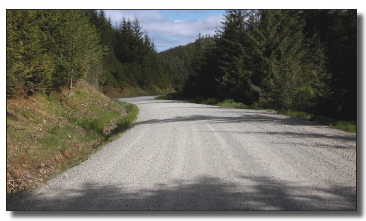
Figure 6—Maintenance level 4 double-lane road with a gravel surface and gravel shoulders. The crown is effective for gravel-surfaced roads to facilitate drainage and maintain a fully functioning surface. This road has been properly bladed to provide a moderate degree of user comfort and convenience. Ditches are kept clean to facilitate drainage. The road is free of litter and the maintenance of the roadside vegetation provides adequate sight distance. Curves and other hazards should be marked with warning signs if advised by a documented engineering judgment or engineering study. Heavy traffic may require dust abatement to maintain standard.