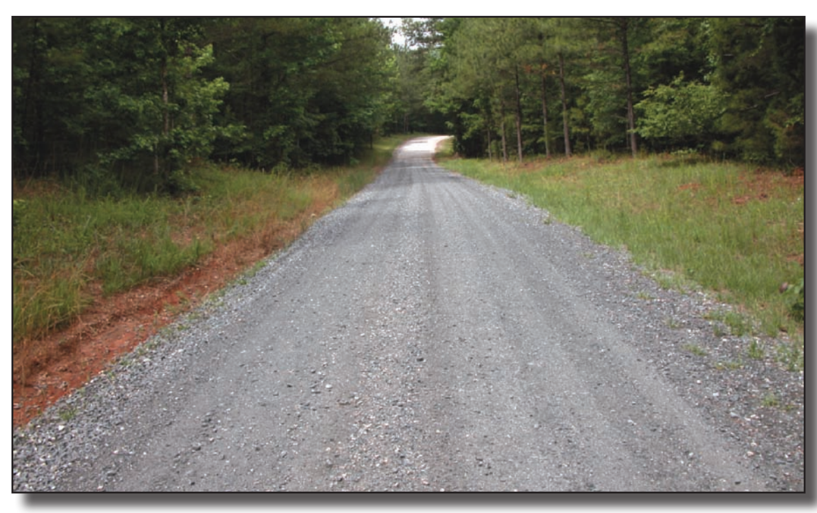
Figure 9—Maintenance level 4 single-lane road with a gravel surface and gravel shoulders. Maintain a proper crown, repair potholes, and remove washboarding to facilitate drainage and to maintain a moderate degree of user comfort and convenience at moderate travel speeds. Maintain ditches to facilitate drainage. The road is free of litter and the maintenance of the roadside vegetation provides adequate sight distance. Curves and other hazards should be marked with warning signs if advised by a documented engineering judgment or engineering study.