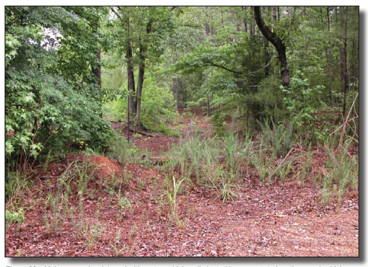
Figure 29—Maintenance level 1 road with motor vehicles eliminated by a vegetated earth mound, which both disguises and physically blocks the road.