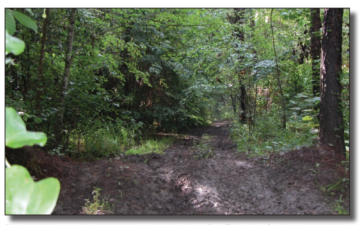
Figure 22—Maintenance level 2 single-lane road with native surface. This road surface is passable by high-clearance vehicles at low speeds and does not require surface maintenance unless significant erosion is occurring. Rutting on the road surface should be corrected at the next scheduled maintenance if it begins to cause unacceptable environmental damage. There is significant vegetation encroachment that could make the road impassable. The encroaching vegetation should be logged out and brushed to provide passage by high-clearance vehicles.