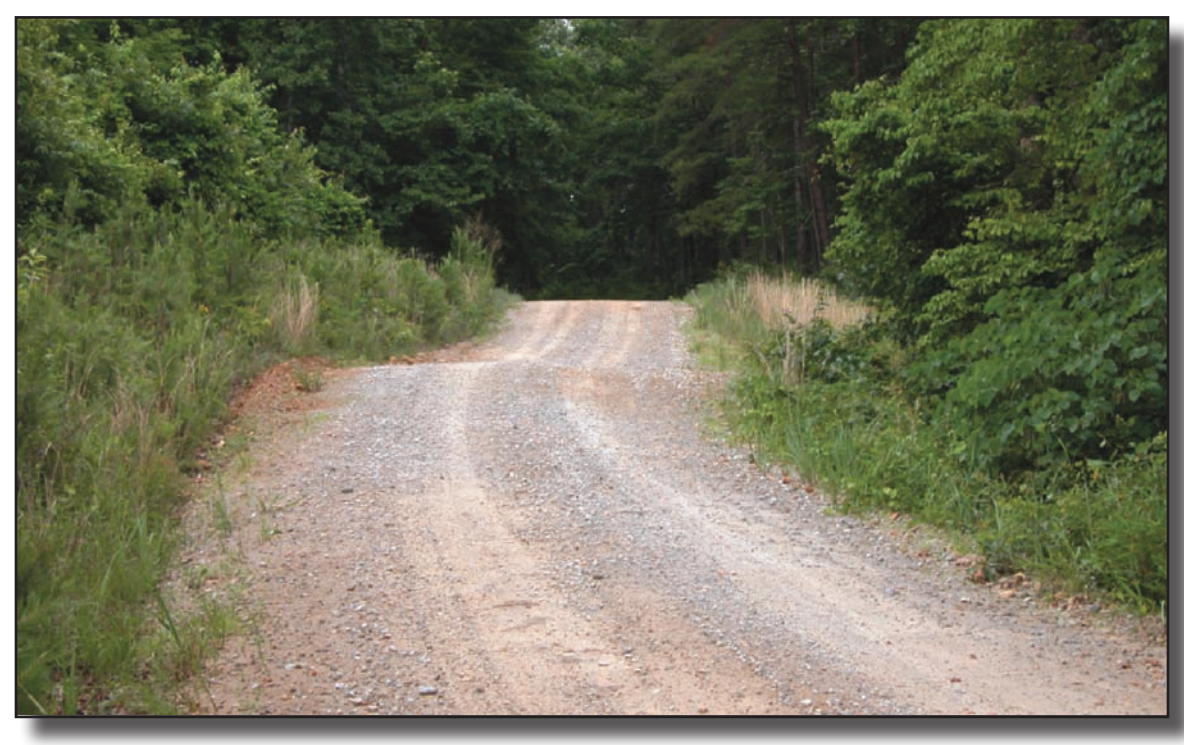
Figure 15—Maintenance level 3 single-lane road with a gravel surface, no shoulders, and a cross-drain dip. Drainage facilities, such as drain dips, should be maintained so they are functional to prevent unacceptable environmental and resource damage and to provide travel by prudent drivers in standard passenger cars. Surface roughness is acceptable if travel by prudent drivers in standard passenger cars is provided. Curves and other hazards should be marked with warning signs if advised by a documented engineering judgment or engineering study.