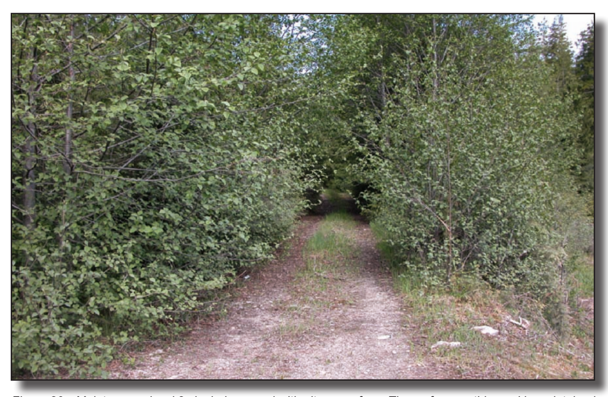
Figure 20—Maintenance level 2 single-lane road with pit-run surface. The surface on this road is maintained adequately for high-clearance vehicles at low speed, and there is no evidence of erosion. However, the vegetation on the shoulder is beginning to encroach onto the traveled way and should be maintained to allow for access by high-clearance vehicles and maintenance equipment. The grass growing on the road surface is acceptable since it is not affecting passage.