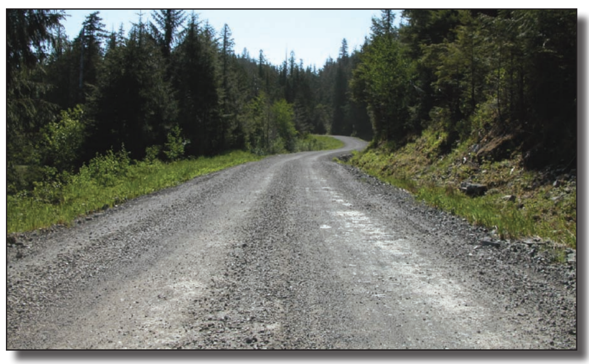
Figure 13—Maintenance level 3 single-lane road with a gravel surface and gravel shoulders. Maintain the crown and keep the drainage functional by properly maintaining the ditches. In the road shown above, removing the berms from the road edge and removing vegetation and other material that would impede the flow of water off the road and through the ditch would improve the drainage. The road is free of litter and the maintenance of the roadside vegetation provides adequate sight distance. Curves and other hazards should be marked with warning signs if advised by a documented engineering judgment or engineering study.