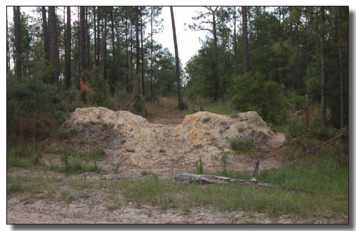
Figure 25—Maintenance level 1 road that has been blocked to motor vehicle traffic by an earth mound. Constructing a berm in a relatively flat terrain (i.e., minimal cut and fill) is a challenge. Periodic maintenance of the closure may be needed to ensure that it is an effective closure. Design the closure features to avoid creating hidden hazards to users, such as snowmobilers and bicyclists. An example of a hidden hazard is deep trenching behind the earth mound.