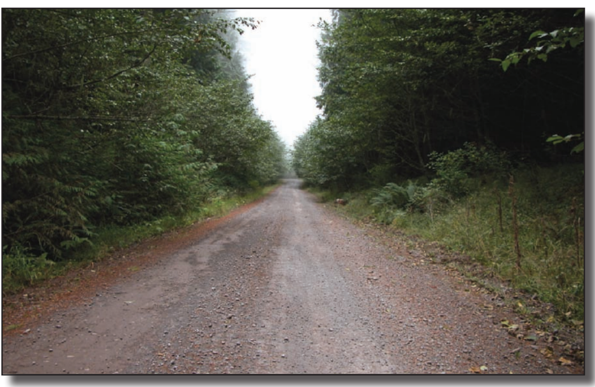
Figure 14—Maintenance level 3 single-lane road with a gravel surface and gravel shoulders. Surface roughness is acceptable if travel by prudent drivers in standard passenger cars is provided. Vegetation up to the road edge is acceptable if it does not interfere with adequate sight distance needed for a maintenance level 3 road. Brushing may be necessary on this road to provide adequate sight distance. The base course and surfacing should be replaced as needed to protect the resource.