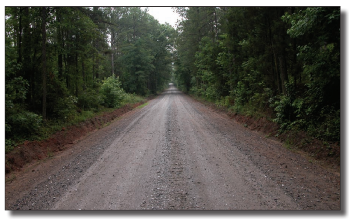
Figure 11—Maintenance level 4 single-lane road with a gravel surface and gravel shoulders with ditches. The ditches have been cleaned out to facilitate proper drainage. Maintain proper crown, repair potholes, and remove washboarding to facilitate drainage and to maintain a moderate degree of user comfort and convenience at moderate travel speeds. Replace surfacing to the depth required for blade maintenance and to prevent wear of the base course. The roadside vegetation is becoming overgrown and should be maintained to provide adequate sight distance.