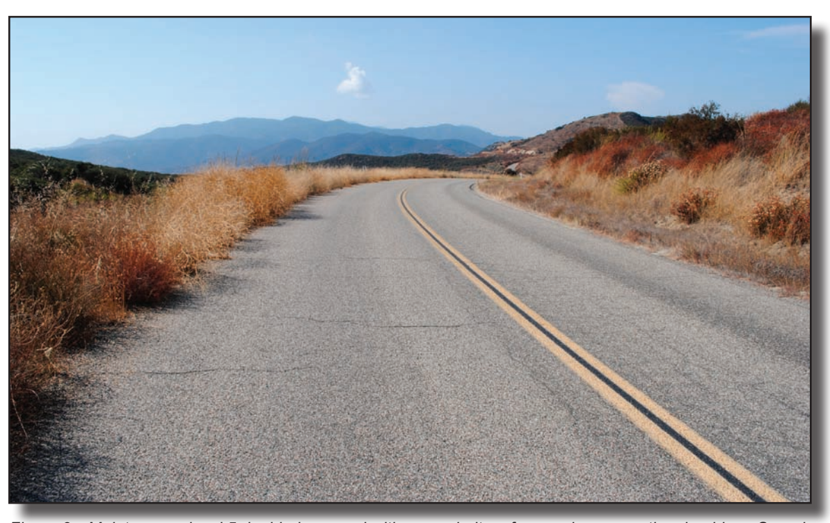
Figure 3—Maintenance level 5 double-lane road with an asphalt surface and grass on the shoulders. Speed limits may be posted as necessary with a Code of Federal Regulations (CFR) order after completion of an engineering study. Grass on shoulders is acceptable and helps with stabilization. Pavement cracking should be monitored so it can be repaired before it has a negative effect on the high level of user comfort and convenience expected on a maintenance level 5 road. Edge markings are not required on a paved road. Ditches are kept clean to facilitate drainage.