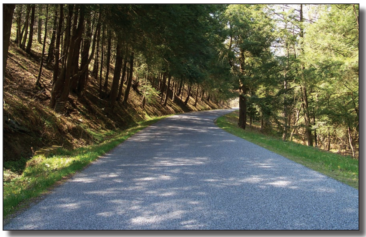
Figure 7—Maintenance level 4 double-lane road with a chip-seal surface and no shoulders. Ditches are kept clean to facilitate drainage. The road is free of litter, and the maintenance of the roadside vegetation provides adequate sight distance. Centerline and edge markings are not required on double-lane paved nonurban roads. Curves and other hazards should be marked with warning signs if advised by a documented engineering judgment or engineering study.