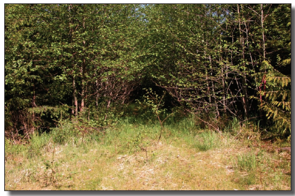
Figure 28—Maintenance level 1 road that has been blocked to motor vehicles by natural vegetative overgrowth. Camouflage is a good alternative when there is limited availability of large rocks or down trees to use as a barrier. Vegetation treatment, such as planting, may be an effective solution in regions with suitable growing conditions.