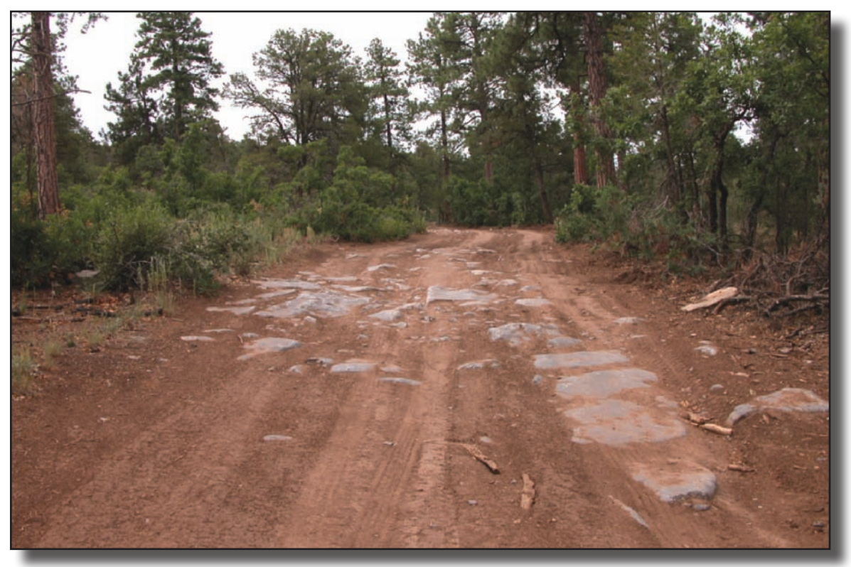
Figure 21—Maintenance level 2 single-lane road with native surface. While the surface on this road is extremely rough, it is still passable by high-clearance vehicles at low speeds. Generally, no additional surface maintenance is required unless unacceptable environmental damage due to erosion or widening occurs.