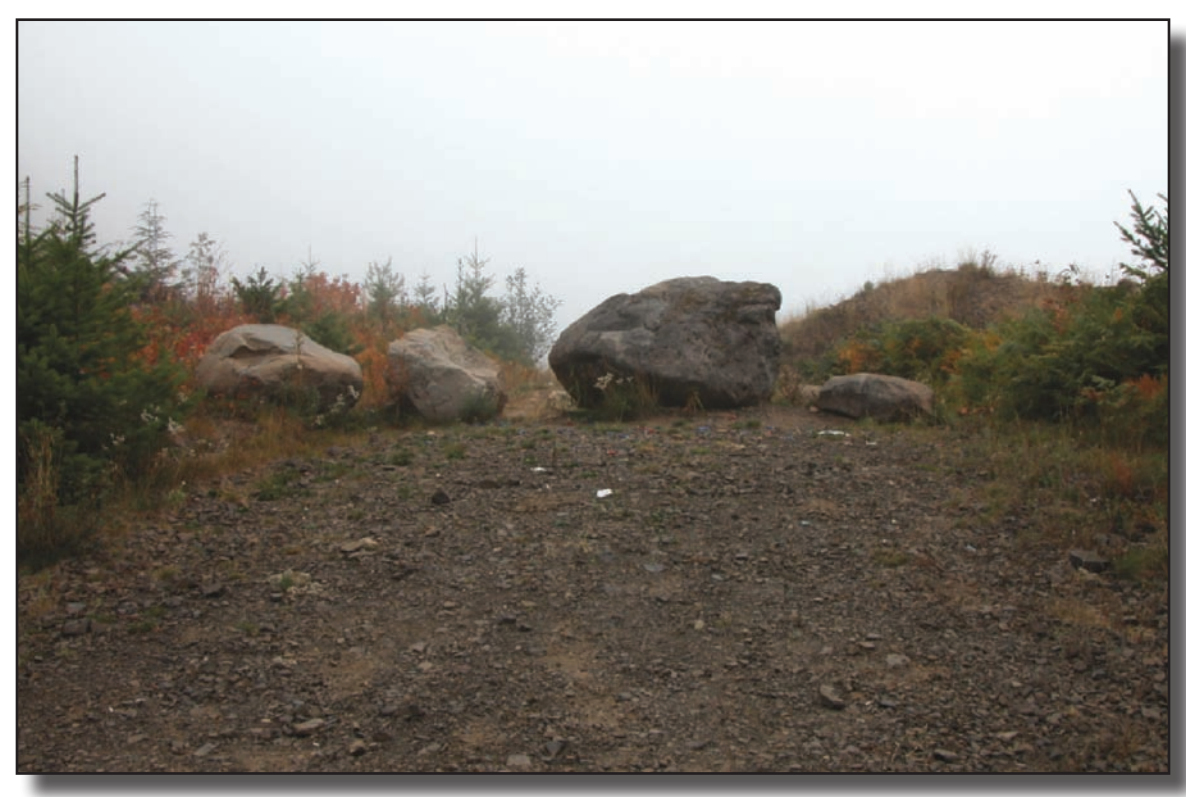
Figure 26—Maintenance level 1 road that has been blocked to motor vehicles by boulders. Partially bury boulders and arrange them in a nonlinear pattern for a more natural look. Boulders may not be an effective natural barrier if adjacent vegetation is grass and light brush. Vertical route markers may be used but are not prominently displayed.