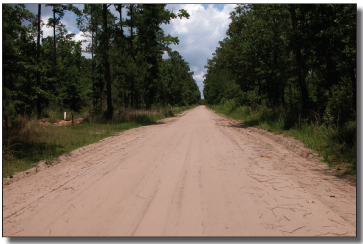
Figure 16—Maintenance level 3 double-lane road with a native surface and shoulders. Maintain road surface to provide adequate drainage. The road is free of litter. Maintenance of roadside vegetation provides adequate sight distance. Surface roughness and rutting is acceptable if maintained for travel by a prudent driver in a standard passenger car. User comfort and convenience are not considered priorities.