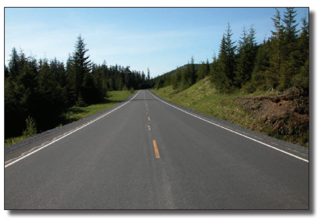
Figure 1—Maintenance level 5 double-lane road with centerlines and edge markings, a hot-mix asphalt surface, and asphalt- and rock-stabilized shoulders. If centerline markings are placed on a road, the no-passing zone markings also shall be placed as determined by an engineering study.