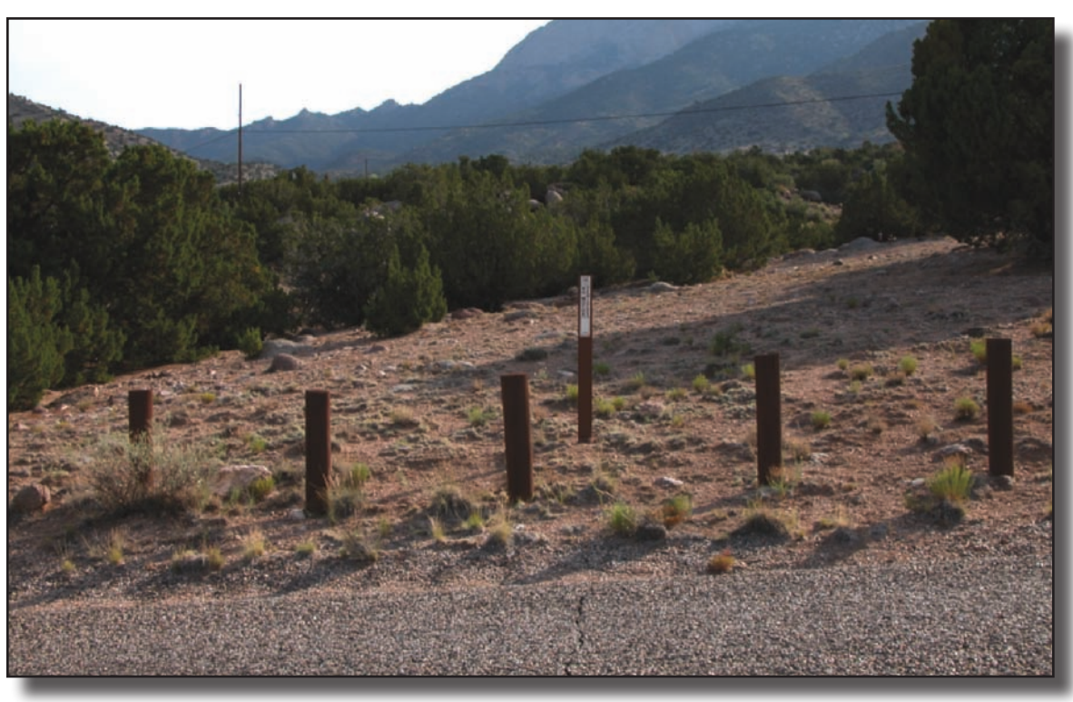
Figure 27—Maintenance level 1 road that has been blocked to highway vehicle traffic by posts and includes a sign prohibiting motorized vehicles. Use type 2 object markers if the posts present a hazard. Wooden posts are easily cut or damaged and removed and may not be an effective closure. Use posts in areas that are patrolled on a regular basis, or near high-use areas. Road restricted signs, with or without reasons, may be used. Route numbers should be displayed on a separate vertical marker from the restriction sign.