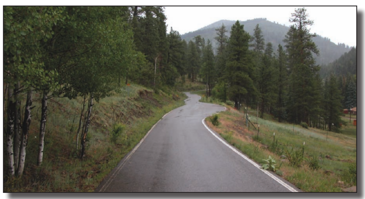
Figure 8—Maintenance level 4 single-lane road with asphalt surface, no shoulders, paved turnouts, and edge markings. It may be desirable to place edge markings when the road has narrow lanes and shoulders as shown in the photo. If it has been determined that edge markings are necessary they should be maintained appropriately. A broken white lane line, with entry and departure breaks, may be used at turnouts to provide continuity of guidance and define the turnout lane. If pavement width is less than required for the travel lane and turnout, mark an uninterrupted uniform lane width without identifying a turnout. The road is free of litter and the maintenance of the roadside vegetation provides adequate sight distance. Curves and other hazards should be marked with warning signs if advised by a documented engineering judgment or engineering study.