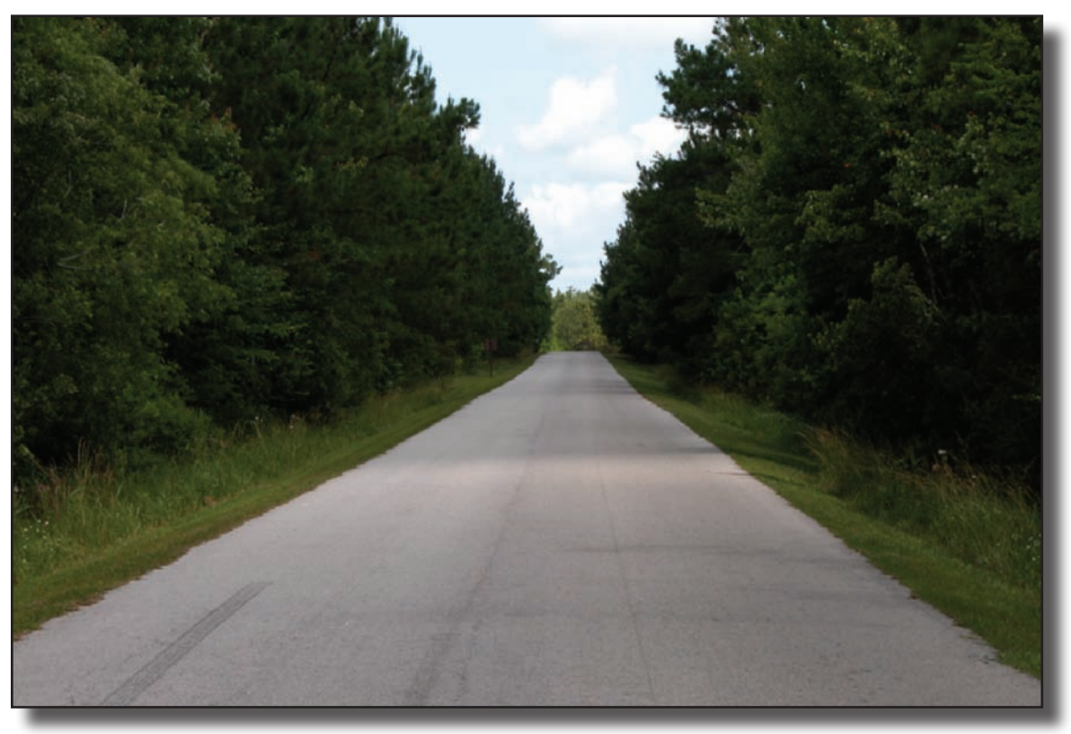
Figure 5—Maintenance level 5 double-lane road with no centerline, no edge marking, a chip-seal surface, and unpaved shoulders. Grass on shoulders is acceptable and helps with stabilization. It is acceptable not to place centerline and/or edge markings on a double-lane nonurban road.