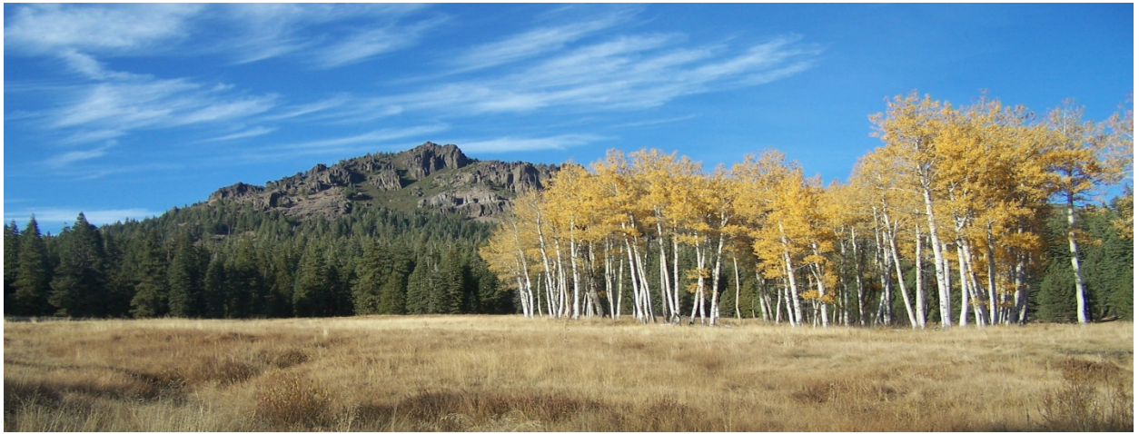
Photo: Ruffa Ridge, Almanor Ranger District