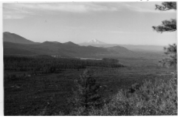
View north to Mt. Shasta from Hat Creek Rim

The PCT continues north on the Hat Creek Ranger District after leaving the National Park. Approximately one mile from the boundary the trail leaves its old location along the base of Badger Mountain and follows a new course, constructed in 1991, through the West Badger Plantations and over to Hat Creek. It continues along upper Hat Creek, past Twin Bridges, to Potato Butte road. At that point the trail is within one tenth of a mile from the town of Old Station. It is an easy walk to Old Station Post Office, general store, pizza parlor and resort.