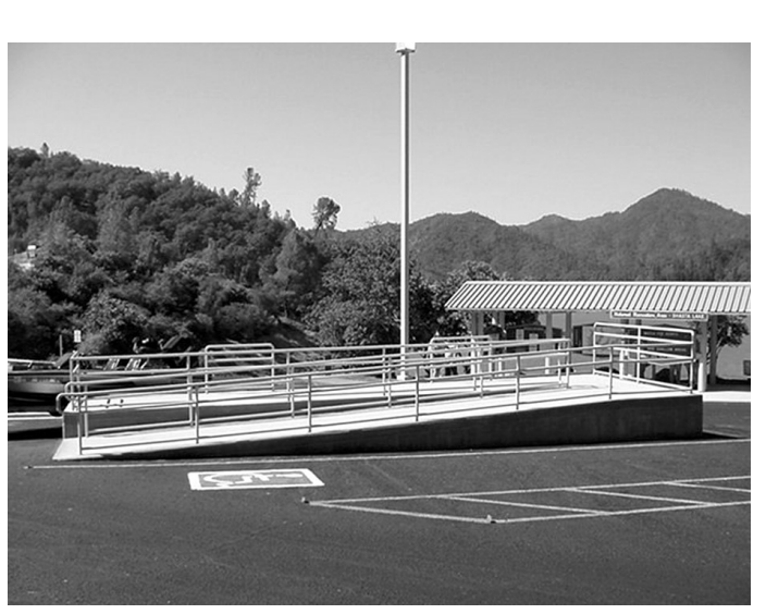
Accessible loading platform located at the Packers Bay public boat ramp at Shasta Lake.

If you would like to use one of these loading platforms at Shasta Lake, they are located at the Antlers, Centimudi and Packers Bay public ramps. At Trinity Lake, there is an accessible loading platform at the Clark Springs public ramp.