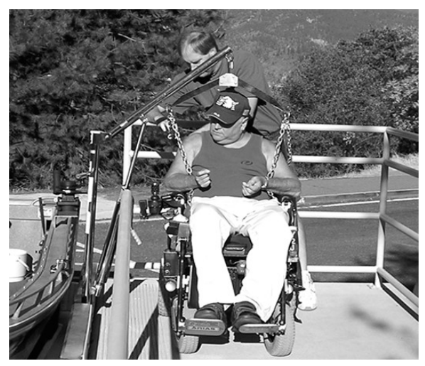
Accessible loading platform and slip for a patient lift at Centimudi public boat ramp at Shasta Lake.

The Antlers, Centimudi and Packers Bay public ramps are usually open all year, however they may be closed when the parking lots fill up or lake debris makes launching hazardous. Clark Springs public ramp is open year round or to 46 foot drawn down.