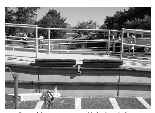
Patient lift receiver on accessible loading platforms.

For current information on public boat ramps at Shasta Lake, contact the Shasta Lake Information Center at (530) 275-1587. For Trinity Lake, contact the Weaverville Ranger Station at (530) 623-2121.