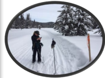
Lolo Pass Visitor Center upgrades funded with fee revenues