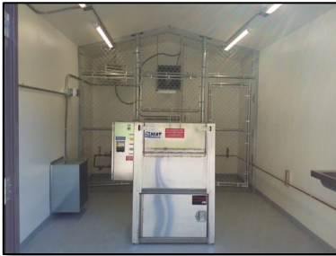
Scat Machine at Hells Canyon Visitor Center, Riggins, Idaho

The SCAT machine provides a user friendly, sanitary means to properly dispose of human waste. The system is a portable toilet dumping station designed for waste disposal at