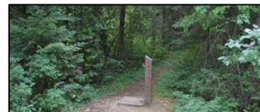
Kelly Forks Campground on the North Fork of the Clearwater River provides spring fed water to campsites

The system providing the Kelly Forks Campground water is decades old and fed by a spring miles away which runs through a pipe that traverses under the road bridge. This main water line under the bridge was broken due to winter damage. Recreation fee revenue funded approximately $2,000 in parts and a week of maintenance crew labor. Campers were able to have water to the sites for most of the summer.