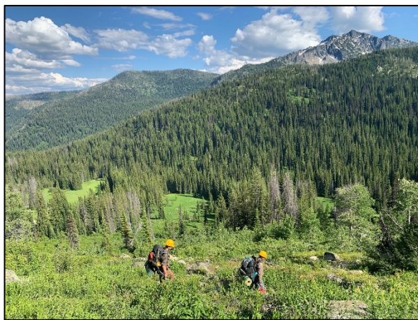
Preserving and promoting history, wild lands and wild experiences. Connecting with communities, building and restoring resilient landscapes, relationships and workforce.