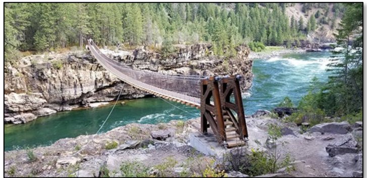
Kootenai Falls Swinging Bridge located between Libby and Troy on the Kootenai River