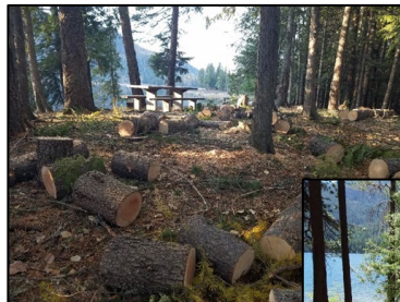
Dorr Skeels Campground tree removal providing more sunlight.

The forest cleared the Dorr Skeels Campground of diseased trees to make way for an improvement project. Crews cut trees into a manageable size and advertised to the public for removal by those holding a current firewood permit. By removing some of these trees, the site now provides more sunlight.