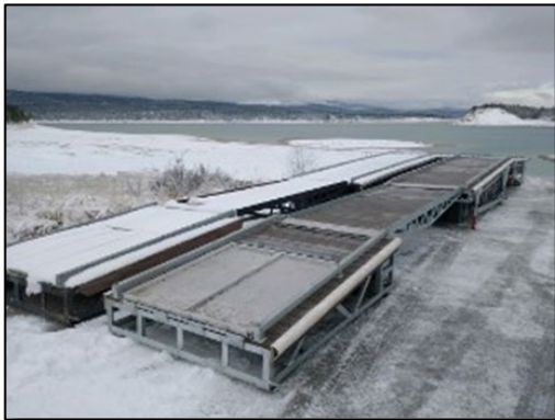
Rexford Bench Campground new dock.

The forest replaced the dock at Rexford Bench Campground. This dock is used to assist visitors when loading and unloading their boat into the Kooconusa Reservoir. Early arrival to the site during the winter months ensures that the dock is ready for use come spring and summer. The dock was funded from the $35,000 in recreation fees collected at this campground.