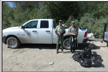
River Rangers clean up trash at popular dispersed camping sites along the Flathead Wild and scenic River