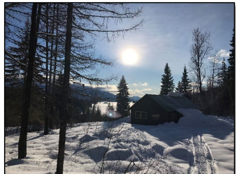
Anna Creek Rental Cabin on a sunny winter day.

Current and future generations benefit as 80-95% of the funds are reinvested in the facilities and services that visitors enjoy, use, and value.