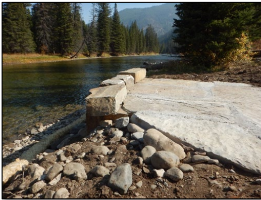
A new accessible fishing platform constructed at Upper Deer Creek on the Gallatin River.

The forest partnered with Gallatin River Task Force to complete a second river access project at Upper Deer Creek on the Gallatin River. The project used $10,000 recreation fee funds as well as $185,000 in partner raised funds to complete the following improvements including two new graveled parking areas for fishing and boating access, a new boat ramp, an accessible fishing platform, and 400 yards of accessible gravel trail.