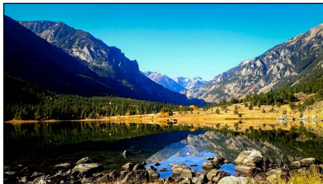
Moose along the shoreline of Emerald Lake