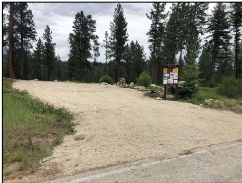
New passenger vehicle parking area at the Lake Como Boat Launch

Lake Como Recreation Area is a high-use popular area that provides visitors with a wide variety of outdoor recreation opportunities, including camping, renting a historic lake-front cabin, picnicking, hiking, horseback riding, mountain biking, interpretive learning, and motorized and non-motorized water sports. The Lake Como Boat Launch parking area can accommodate 42 vehicles with trailers but had a limited amount of passenger vehicle sites. An increase in non-motorized water sports (stand up paddle boards, kayaks, etc.) prompted the need for additional non-trailer parking sites. A new gravel parking area was constructed to provide more space for non-trailer vehicles. The project total was $5,500. Approximately $2,500 of recreation fee collections was spent on crews to spread gravel and install the information board. Regular appropriated funds were used for the remainder of the project.