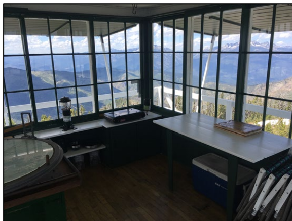
Views of the Selway-Bitterroot Wilderness can be seen from Medicine Point Lookout, a popular rental on the Bitterroot National Forest.