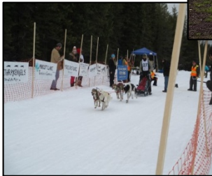
Priest Lake dog sledding recreation event