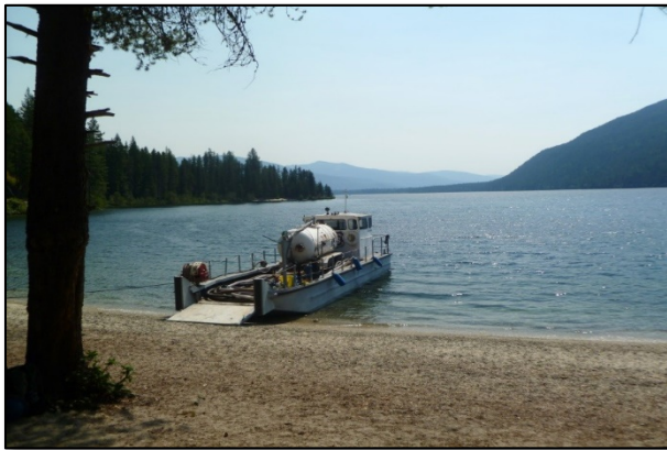
Maintaining restroom facilities at boat-in campsites on Priest Lake

The forest operated and maintained over 110 campsites, a host cabin and over 20 vault toilets on the islands and shore line of Priest Lake with an investment of approximately $50,000 of recreation fee funds. The barge is critical for operation, maintenance and repairs to all of these facilities, and removed over 7,000 gallons of waste in 2019.