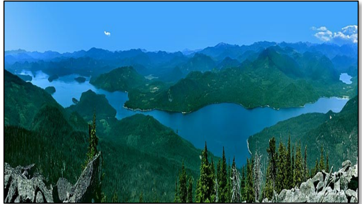
Scenic views from the forest