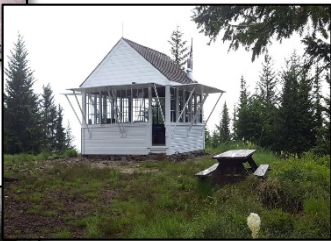
Spyglass Ground House