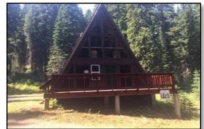
New additions to the cabin rental program!

The forest added Beaver Creek Cabin and Spyglass Ground House to reservation services for the 2019 season. The forest manages these two sites plus ten other historic rental cabins and lookouts using recreation fee revenue. Fee dollars in concert with grants, donations and volunteer labor supported both of these renovation projects, and will continue to fund cleaning, maintenance and repairs at these rental locations. Reservations can be made at www.recreation.gov .