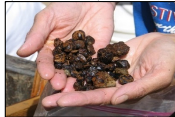
Star Garnets collected from Emerald Creek Garnet Area

Gem enthusiasts and rock hounds enjoy mining for rare star garnets at the Emerald Creek Garnet Area. In 2019, the forest was unable to secure enough material to open to the public. However, the forest invested $20,000 of recreation fee dollars and leveraged other funding sources to excavate new panels for the 2020 season. When open, seasonal employees assist with well over 6,000 visitors, including 1,500 children. Most people walk away with 2 to 3 ounces of star garnets, but more serious diggers occasionally find 4 to 6 pounds in a day.