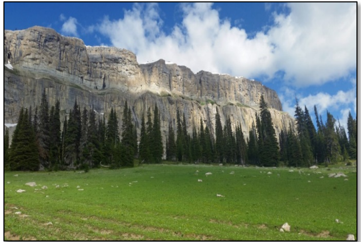
The Chinese Wall in the Bob Marshall Wilderness