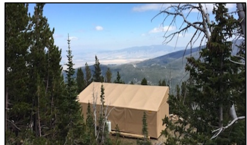
Visitors enjoy staying in remote locations

In this remote yet popular high elevation recreation area in the mountains above Townsend. An outfitter offers year-round yurt rental that is most popular in winter despite only non-motorized access. The forest invested $225 of outfitter permit fees for trail and travel management signs, while the permittee invested $450 worth of in-kind work to install the signs and perform over 15 miles of area trail clearing and maintenance.