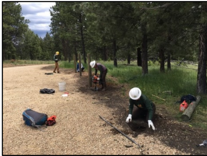
Crews work in the parking lot at the Park City Trailhead

The popular Park City Trailhead is a drop-off point for two outfitters who provide services for hikers and bicyclists. The City of Helena improved the trailhead using grant funds from the Missouri River Resource Advisory Committee and the forest spent $350 in outfitter guide permit funds to replace parking stops and perimeter fencing. The installed parking stops were constructed and installed by a Youth Conservation Corps/Montana Conservation Corps team and the fencing was installed by forest staff.