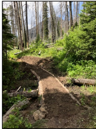
Completed new puncheon bridge

The forest invested $8,000 in recreation fee dollars to replace 120 feet of rotten and hazardous puncheon bridges with turnpike. The Montana Conservation Corps helped with this project. An outfitter volunteered to pack gravel to the turnpike location in concert with the Forest Service pack string.