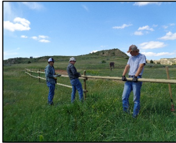
Employees work together to construct the new split rail fence

Organized recreation events are a major draw for visitors to the Dakota Prairie Grasslands, bringing people from all over the country. The popular "Badlands Race Series" used the Wannagan Campground as an aid station and checkpoint, which led to overcrowding and use conflicts. In response, the Grassland organized an employee workday to expand and enhance the adjacent Wannagan Trailhead for event use. They installed a new split rail fence, trailhead sign and information kiosk to enhance visitor experience and define the trailhead location. In addition, local volunteers joined forest trail staff to construct a spur trail connecting the trailhead to the Maah Daah Hey Trail. The fence supplies and information kiosks were purchased with recreation fee funds and trail was constructed with donated gravel.