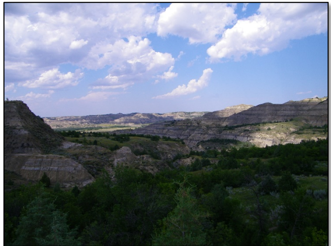
Scenic overlook of the North Dakota Badlands