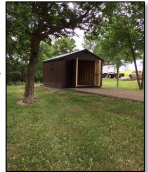
A storage shed was constructed at Buffalo Gap Campground

The Grasslands purchased and installed a 12 foot by 16 foot pre-built storage shed at Buffalo Gap Campground with $4,400 in recreation fee funds. The onsite storage reduced the amount of travel required for operations and maintenance, and improved security for equipment and supplies. The shed was upgraded to be a simple, practical workshop for campground hosts and recreation staff. Future plans include installation of the similar sheds at Civilian Conservation Corps and Hankinson Hills Campgrounds.