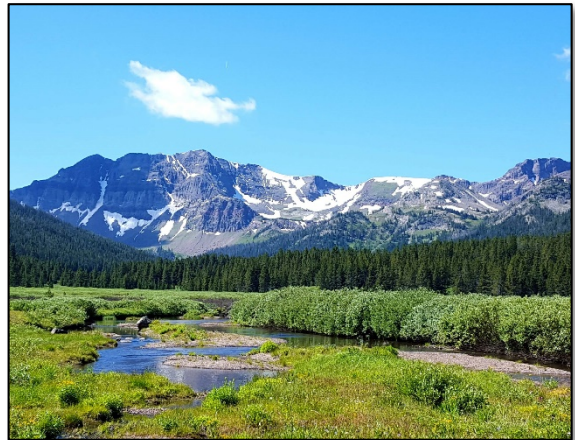
The headwaters of the East Fork of the Main Boulder River