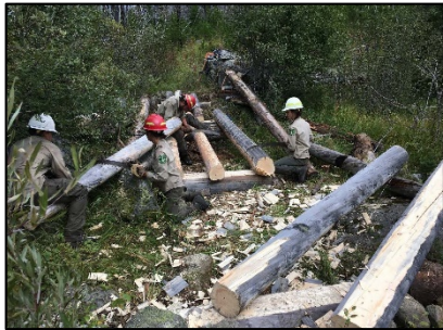
Trail crew constructing puncheon on the West Boulder Trail

A forest trail crew constructed 98 feet of puncheon deep in the Absaroka Beartooth Wilderness, on the West Boulder trail. The trail is a main artery into the Wilderness, and is a popular travel corridor for the public and outfitter-guides. The crew replaced two failing puncheons that became a safety hazard due to age. The Forest Service Region One Pack String assisted by packing in 70 treated planks for use on one puncheon, while native materials were used to construct the other puncheon. Recreation fee funds covered the trail crew salary for the project, totaling approximately $4,000.