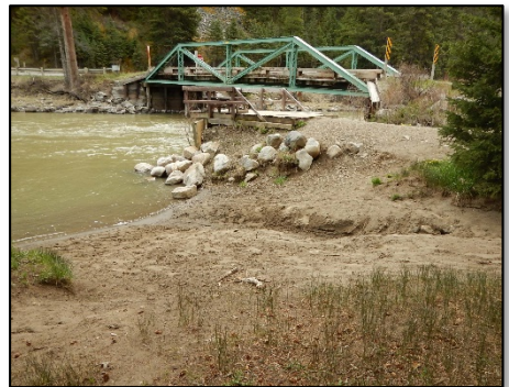
Erosion at the current river access at Deer Creek Trailhead

The forest continued working in partnership with the Gallatin River Task Force to improve river access sites and reduce impacts to the river from recreational use. In 2019, the forest hired a consultant to design improvements to the Deer Creek Trailhead and Upper Deer Creek River Access Site. The project will improve river access for outfitters by creating a safer access point away from a busy trailhead. Approximately $10,000 of recreation fee funds covered the cost for this design work.