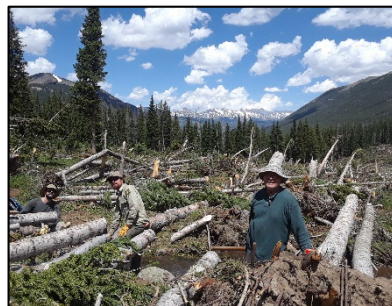
Volunteers from the American Hiking Society clear a trail of avalanche debris