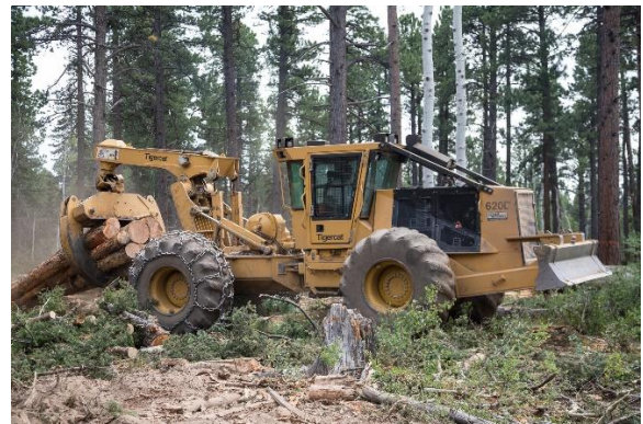
Log loader working on a timber sale.