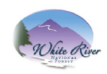
Exhibit A White River National Forest Summer Designated Bike Route System Special Order # 2017-17 December 2017