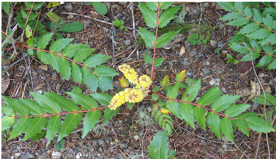
Oregon grape ( Berberis aquifolium ), which is not uncommon in the Pacific Northwest or the Six Rivers National Forest, is a Special Forest Product . Its large berries are used to make jelly and a purple dye. The inner bark yields a yellow dye. The foliage is used by florists for greenery and a small gathering industry has been established in the Pacific Northwest.

Mad River Ranger District 741 State Highway 36 Bridgeville, CA 95526 (707) 574-6233