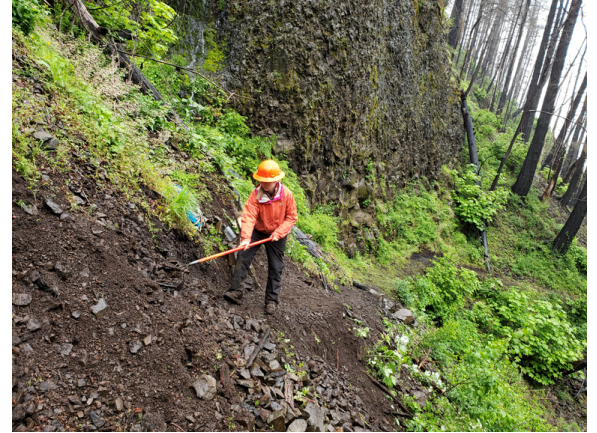
Clearing debris on Oneonta Trail

We've also been helping clean up hazardous trees and limbs from Wyeth and Eagle Creek Campgrounds, using a mechanical person-lift and ropes to access tree canopy. Limbs are cleared on an annual basis prior to campgrounds opening. Due to the pandemic, we do not yet have a timeline for the 2020 campground reopenings but we are getting work done so that we'll be ready when the time is right.