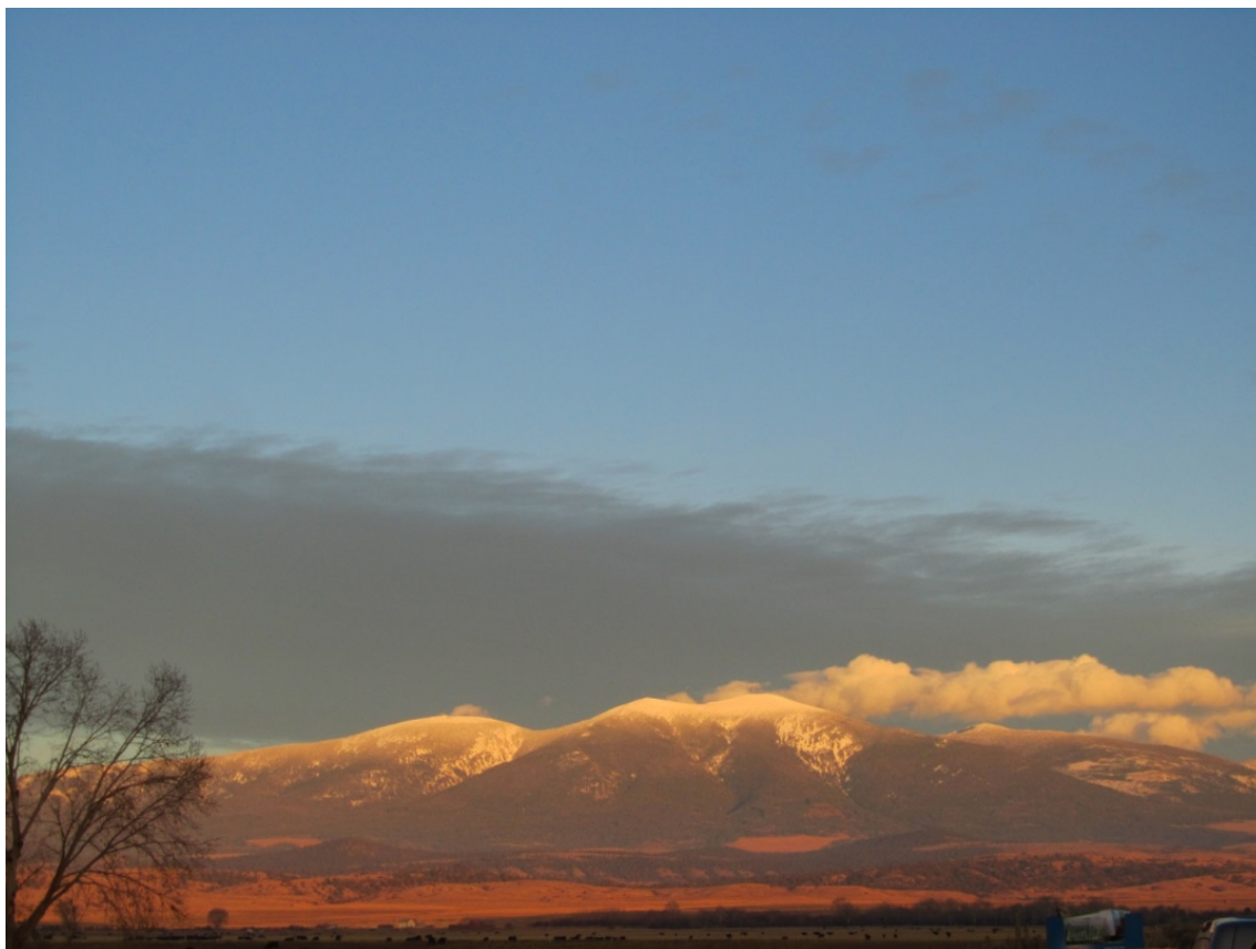
Figure 1. Looking east at Mount Baldy from the Missouri River valley