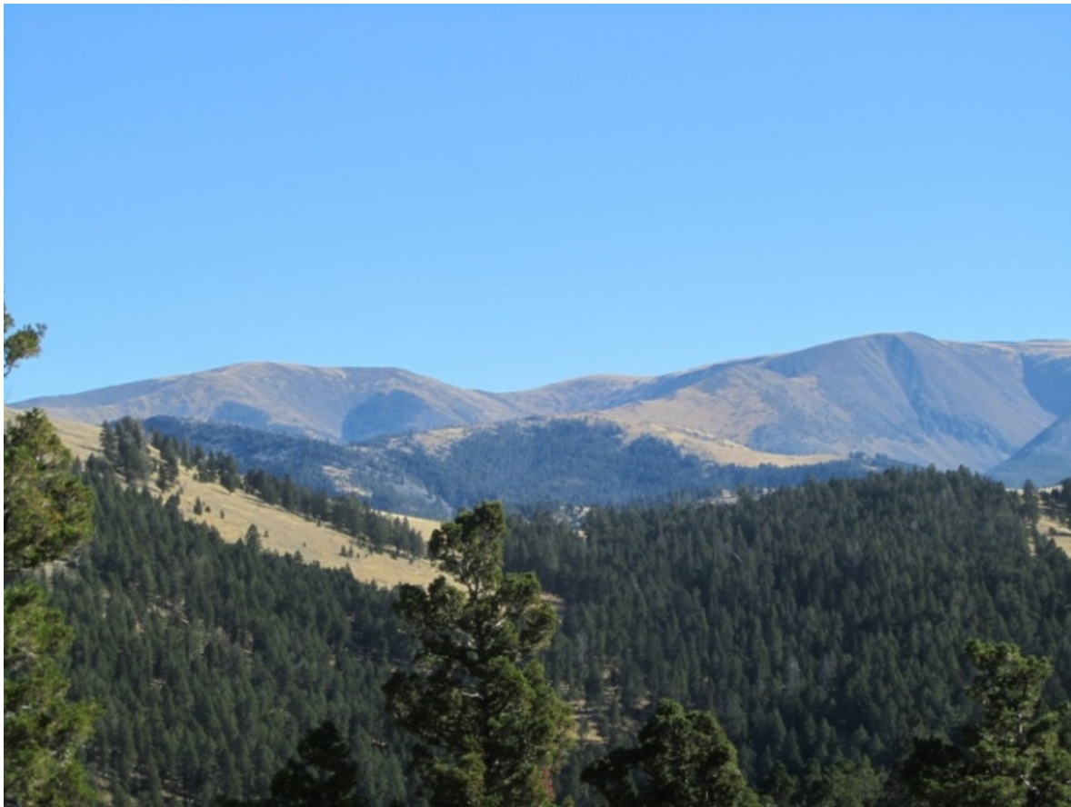
Figure 8. Patterns of vegetation on a long ridge ascending to Loco Mountain

All of the GA's streams drain into the Musselshell River on their way to the Gulf of Mexico via the Missouri River. The most prominent drainages are the American, Bozeman, Musselshell Forks, Cottonwood, and Little and Big Elk Creeks. Riparian forests of aspen, willow, dogwood and cottonwood grow along their courses. Grasslands occupy much of the lower elevations and intergrade with coniferous forests dominated by lodgepole pine, Douglas-fir, and subalpine fir at higher elevations. Small patches of deciduous trees punctuate the dense canopy of evergreen trees. At the highest elevations, conifer forests give way to alpine habitats. Fire was a major influence on plant communities.