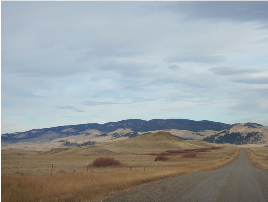
Figure 4. View of Whetstone Ridge from the south