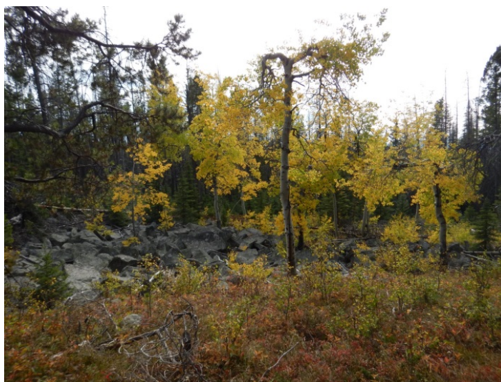
Figure 15. Aspen and granite boulders create an opening in a closed canopy of conifers, southwest subarea (photo by USDA FS)