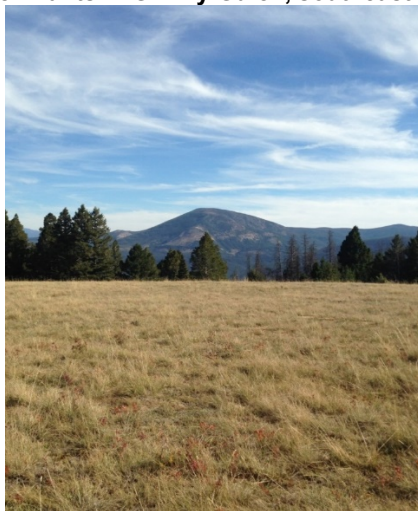
Figure 19. Red Mountain from the Continental Divide, southeast subarea