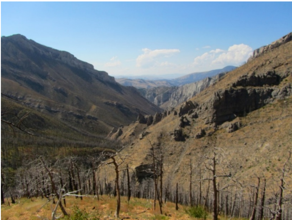
Figure 3. Meriwether Canyon in Gates of the Mountains Wilderness