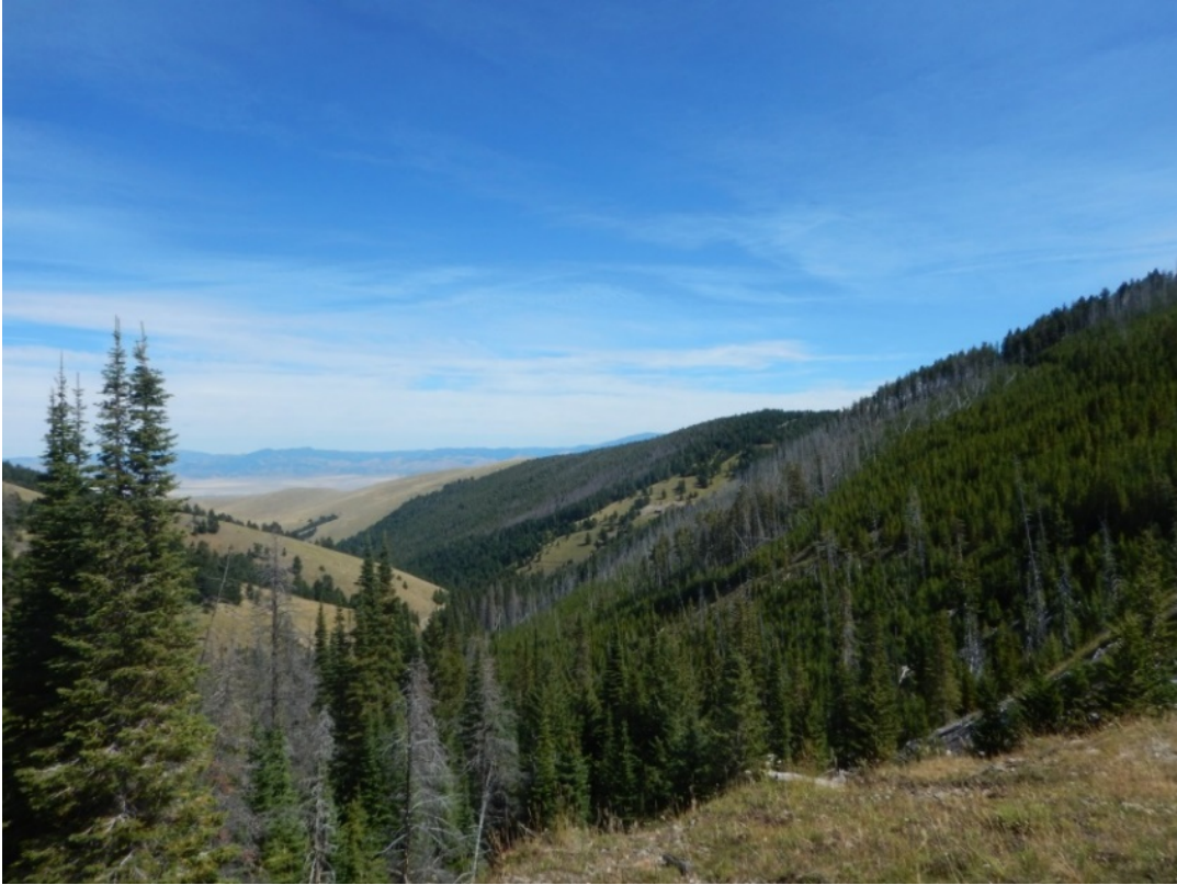
Figure 21. Looking north down Weasel Creek towards Canyon Ferry Reservoir and Big Belt Mountains