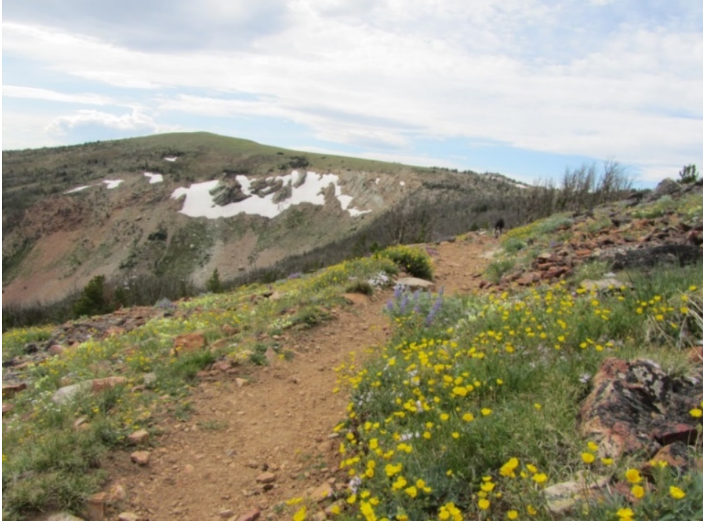
Figure 2. High elevation ridge between Mount Baldy and Mount Edith