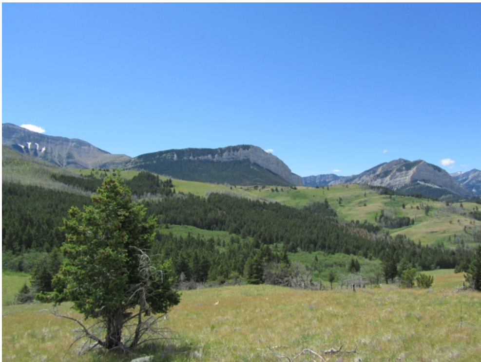
Figure 31. Looking west; Vegetative patterns (prairie, woodland, forest), Ear Mountain area