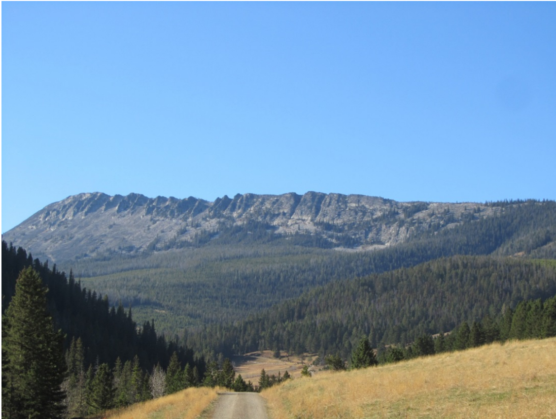
Figure 7. Looking towards Virginia Peak, elevation 8,769 feet