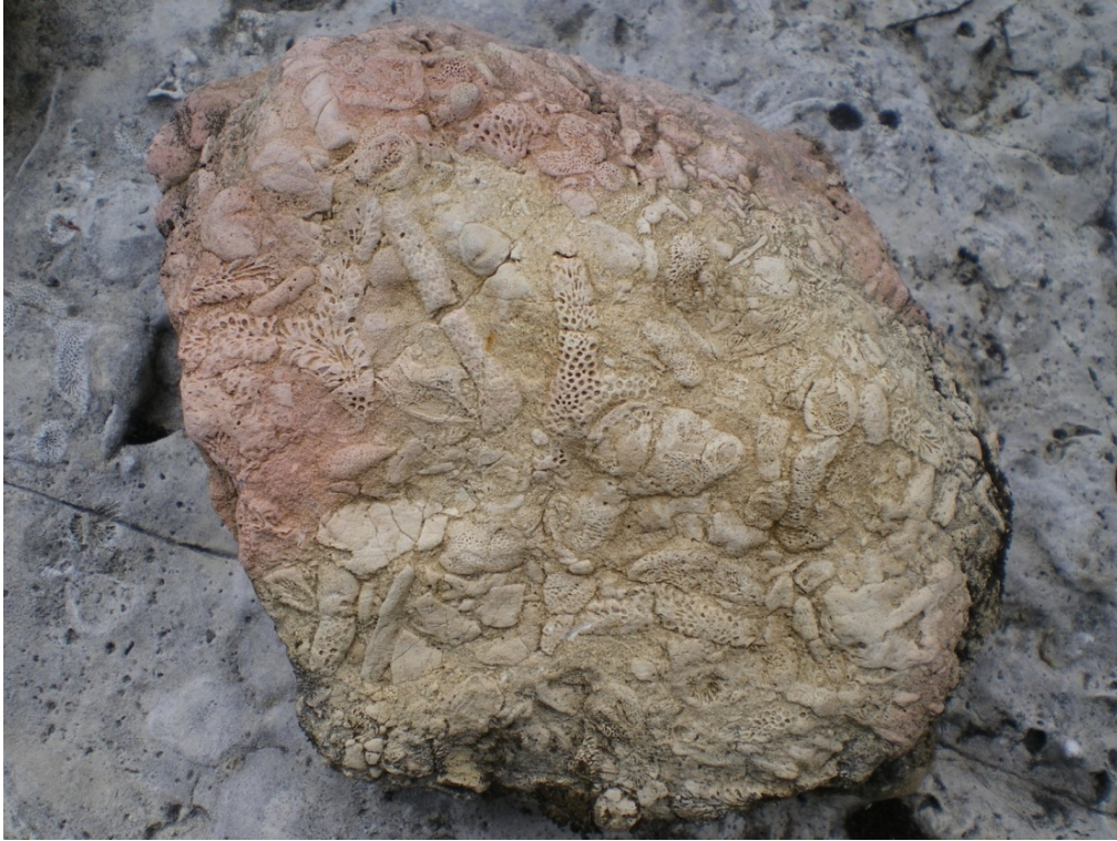
Figure 35. Fossil