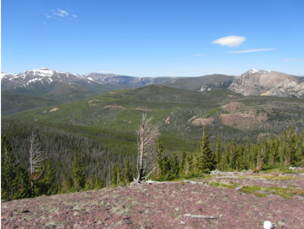
Figure 38. Looking north into the Scapegoat Wilderness from the slopes of Red Mountain