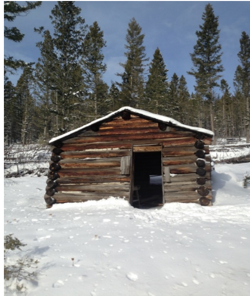
Figure 16. Historic structure, northeast subarea

The geology is composed of rocks of both volcanic and sedimentary origin. Highest points are along the Continental Divide, Meyer's Hill at 7,129 feet and Roundtop Mountain at 6,916 feet. The lowest elevations are roughly 5,160 feet. Water is scarce, and streams are infrequent. Little Prickly Pear Creek's headwaters and canyon begin here.