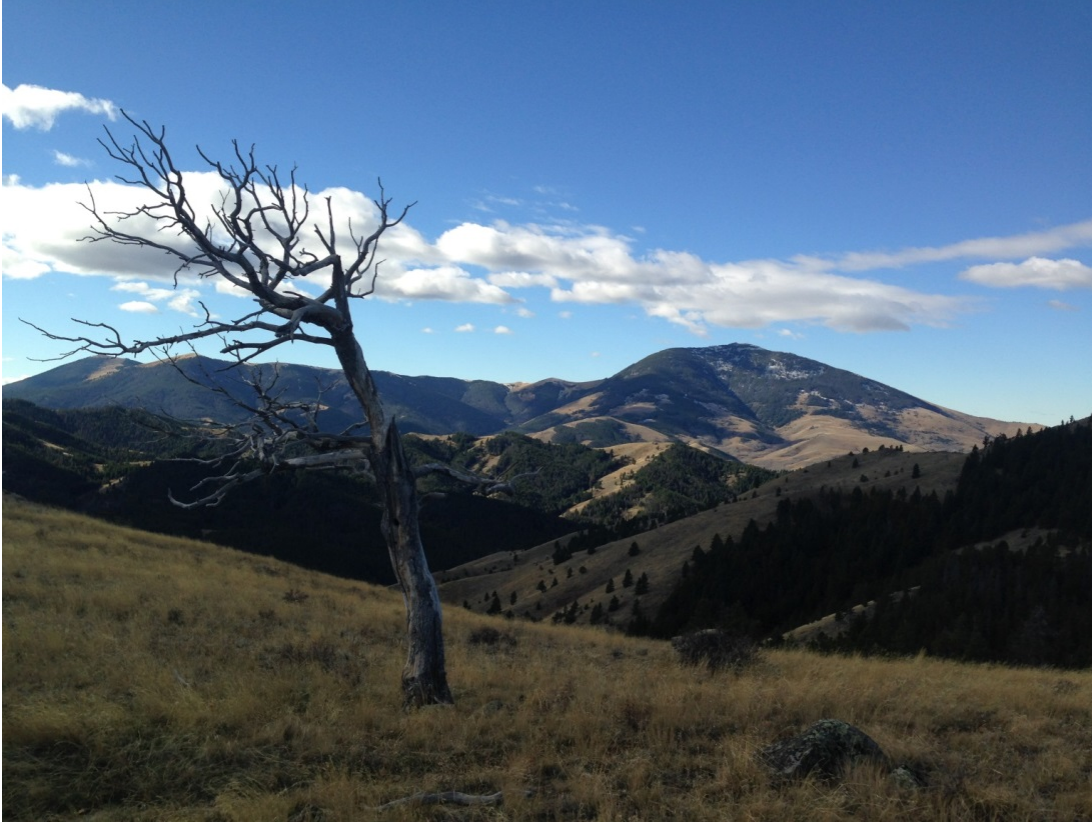
Figure 23. Looking west from ridge on Windy Mountain, view of North Peak (left) and Highwood Baldy (right)