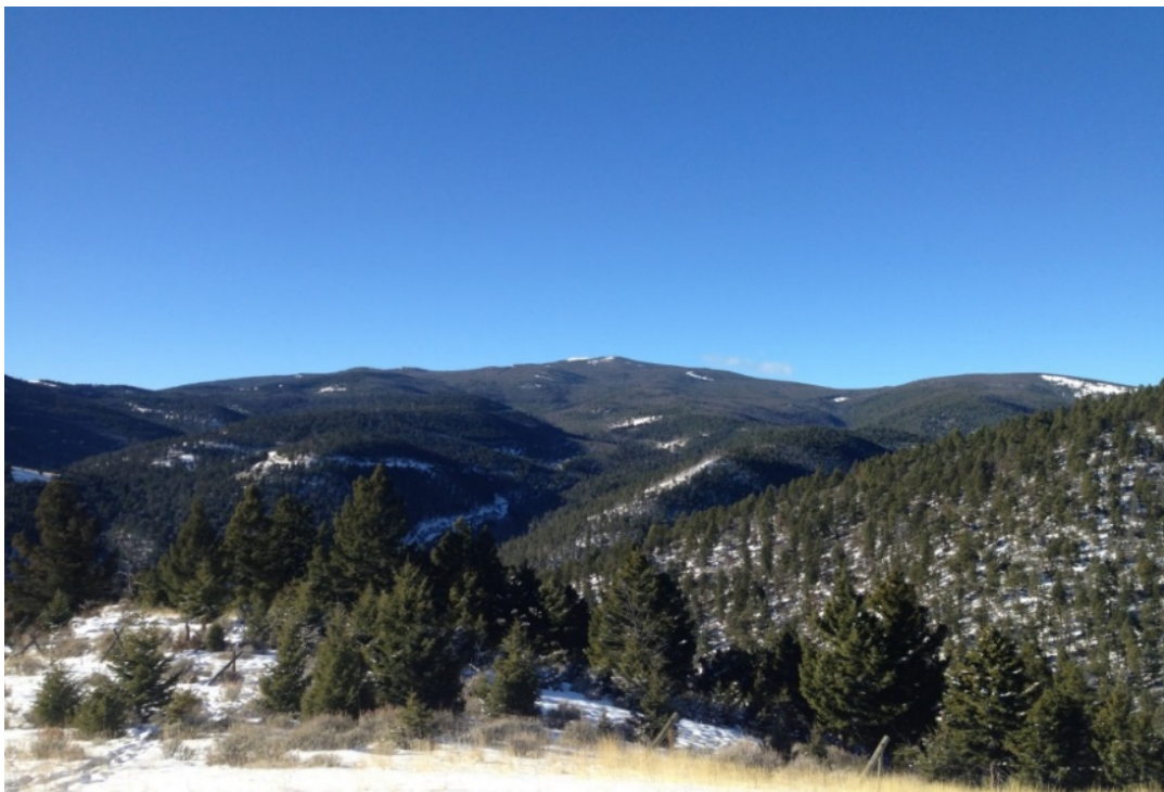
Figure 22. Looking towards Crow and Elkhorn Peaks from the southeast