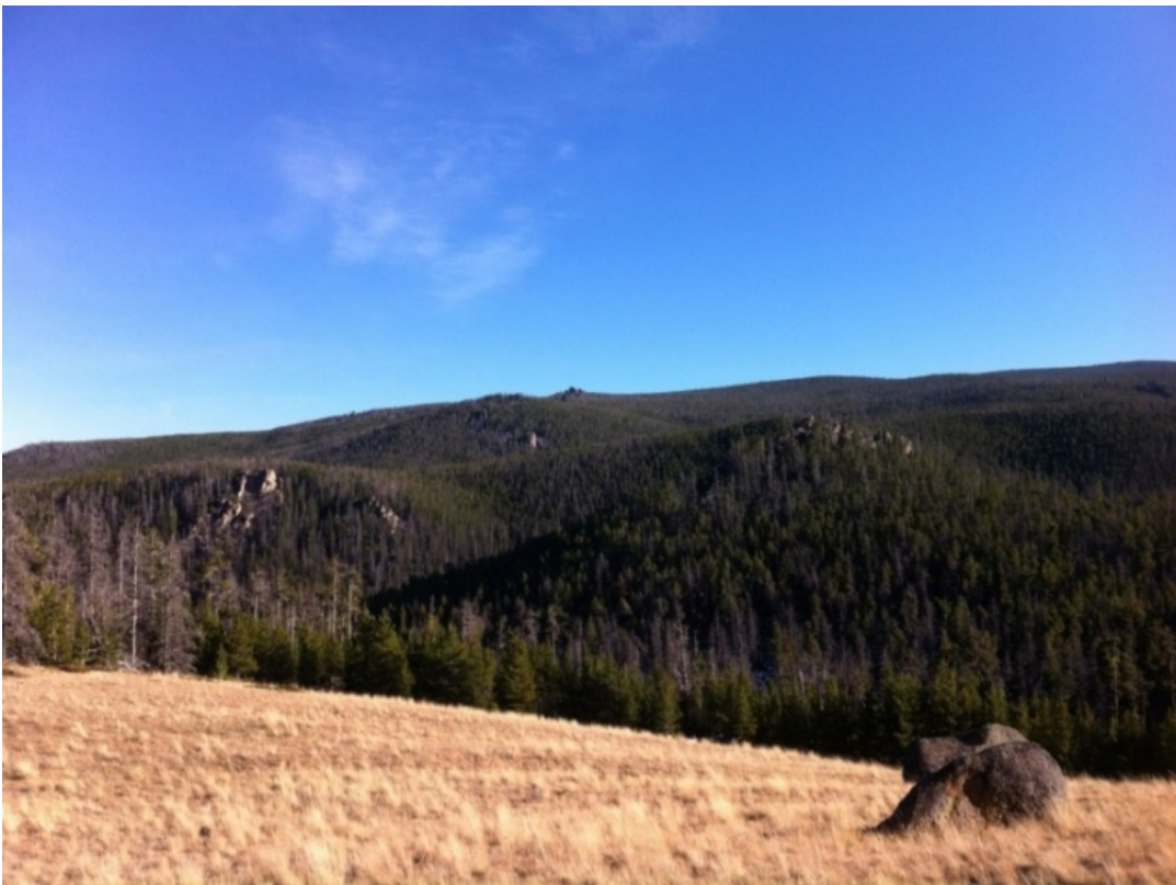
Figure 5. View of the granite, castle-like outcrops that extend above a coniferous canopy, looking southeast towards Woodchuck Mountain

The Castles GA is surrounded in the lower grassland elevations by the North and South Forks of the Smith River on the west and the North and South Forks of the Musselshell River on the east. Many spring fed streams drain from the mountains into these forks, some cutting deep gorges and some sinking underground. Major drainages are Warm Springs, Checkerboard, Flagstaff, Beartrap, Fourmile, Richardson, Grasshopper, Bonanza, and Cottonwood creeks. Willow Creek is the municipal water source for White Sulphur Springs. The western slopes are wetter than the porous eastern limestone slopes.