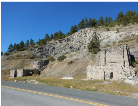
Figure 18. Lime kiln remnants in Grizzly Gulch, southeast subarea

Overall water is scarce, but Helena's primary water source, Tenmile Creek, is found here. Some waterways have been impounded to capture water for utility and recreation, such as Chessman Reservoir and Park Lake. Drainages are characterized as being heavily incised with constrained riparian areas such as Lump Gulch and Orofino Gulch. Some gulches have remnants of historic mining, such as kilns, that recall an era of fine craftsmanship.