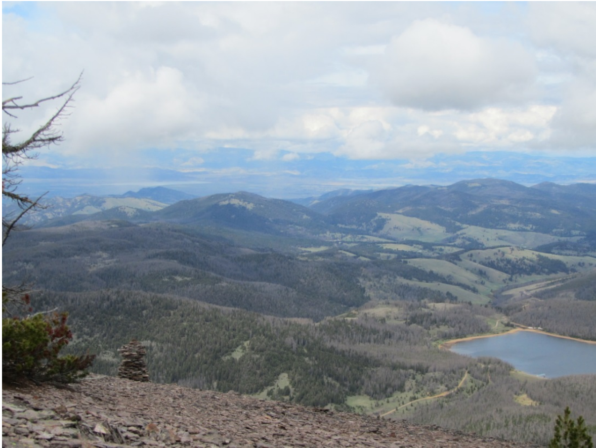
Figure 10. Chessman Reservoir from the summit of Red Mountain