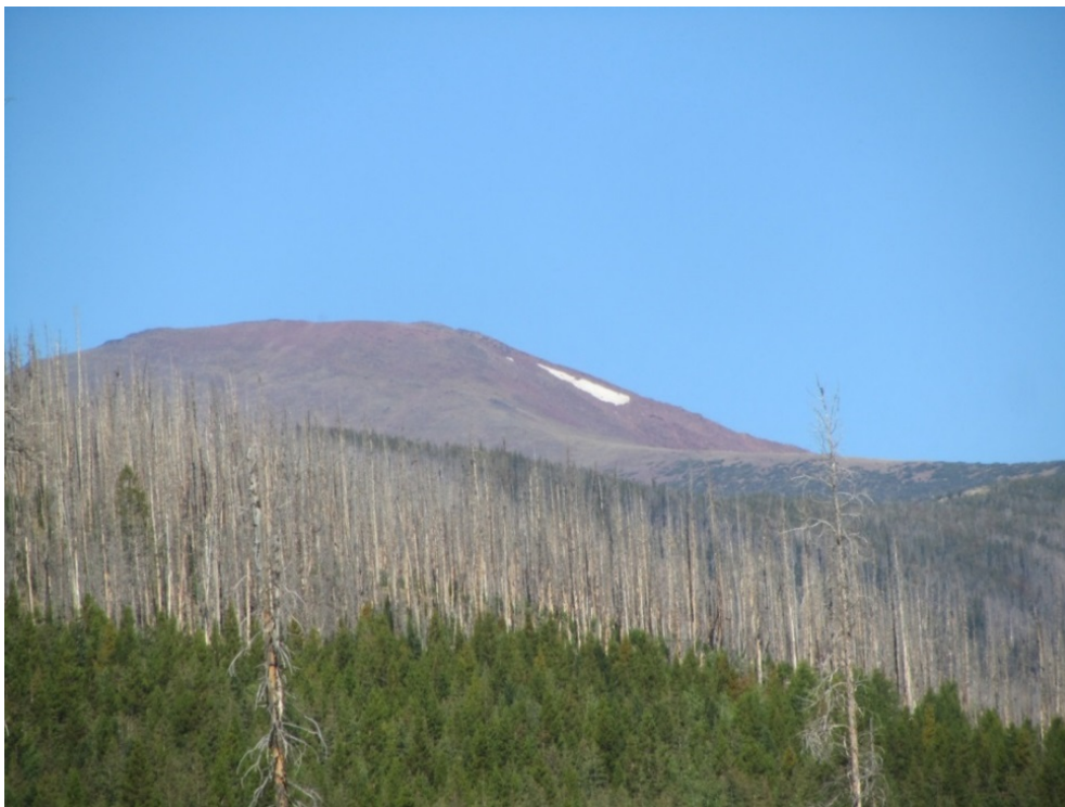
Figure 39. Red Mountain