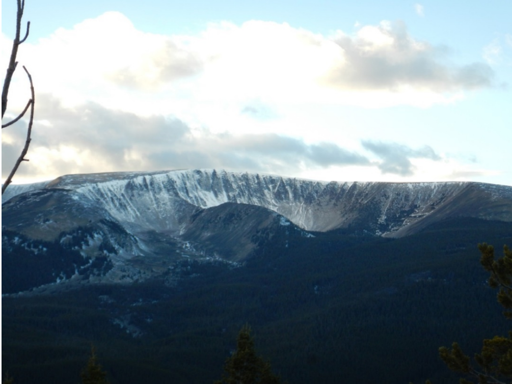
Figure 27. Evidence of glaciation on the east side of Big Baldy Mountain