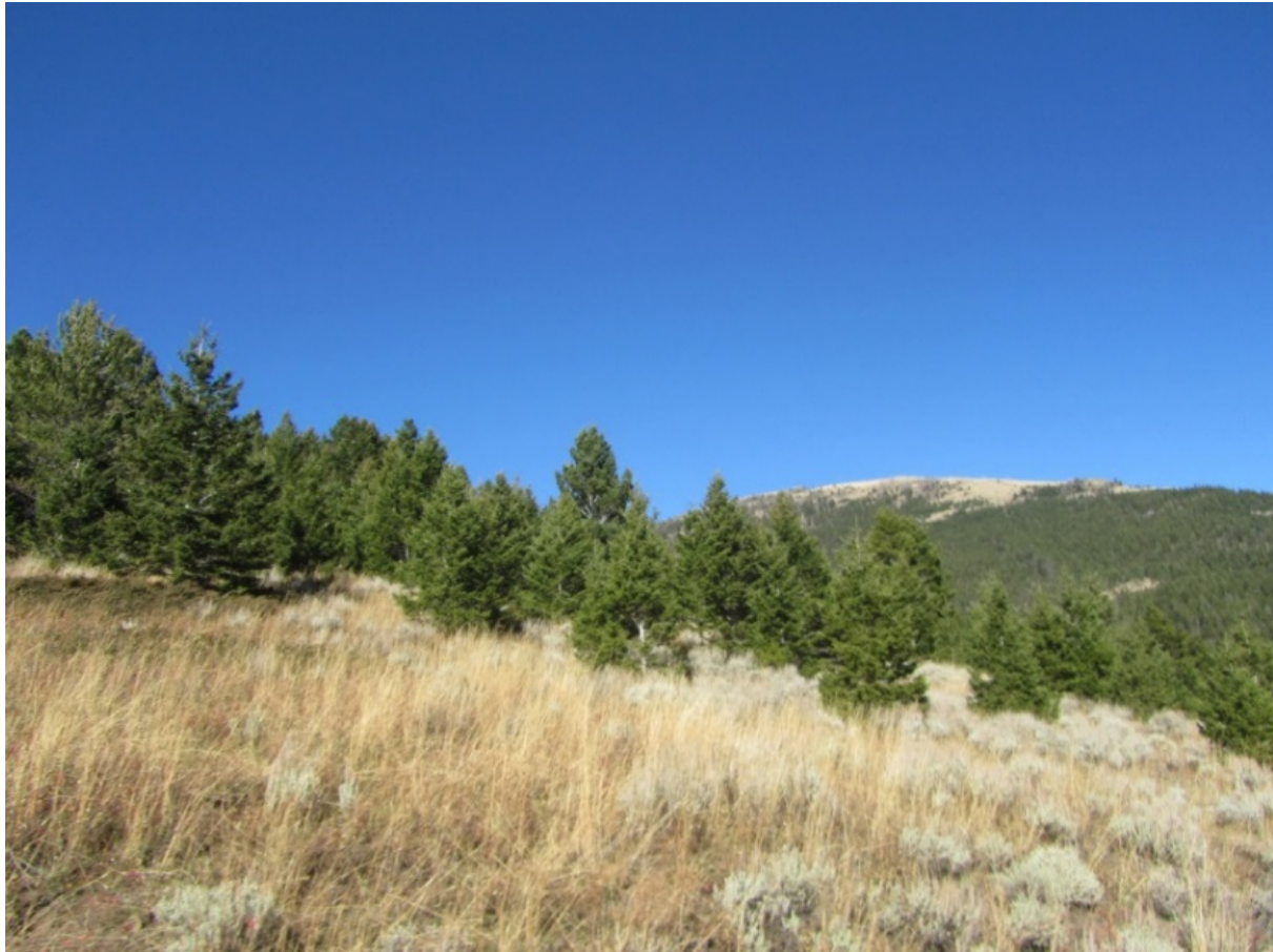
Figure 9. Foreground view showing encroachment of Douglas-fir into sagebrush grassland