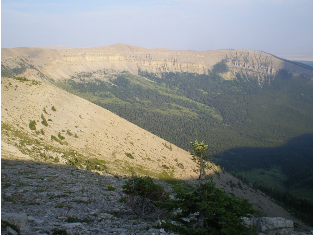
Figure 32. Steep-walled, amphitheater-like basin