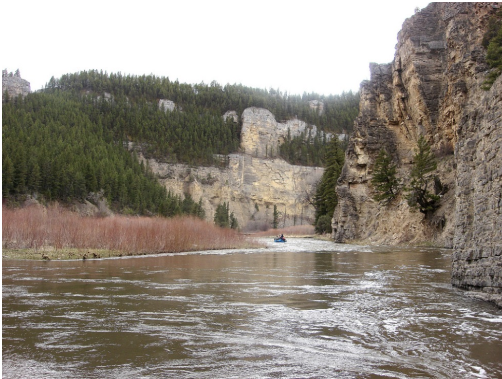
Figure 28. Smith River Canyon on the northwest boundary