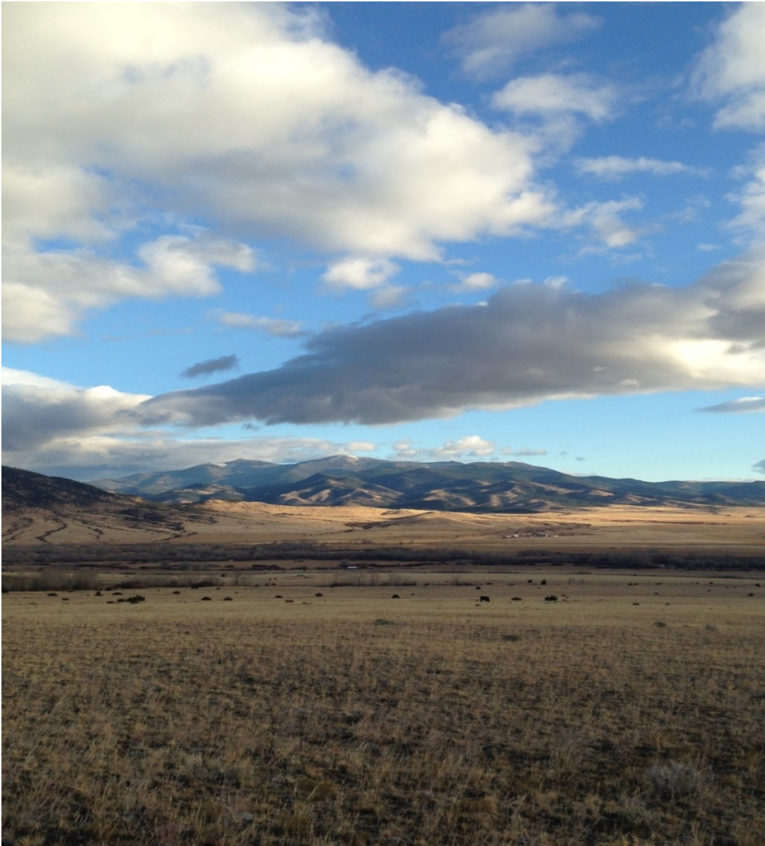
Figure 20. Crow and Elkhorn Peaks from the Boulder River Valley, looking north