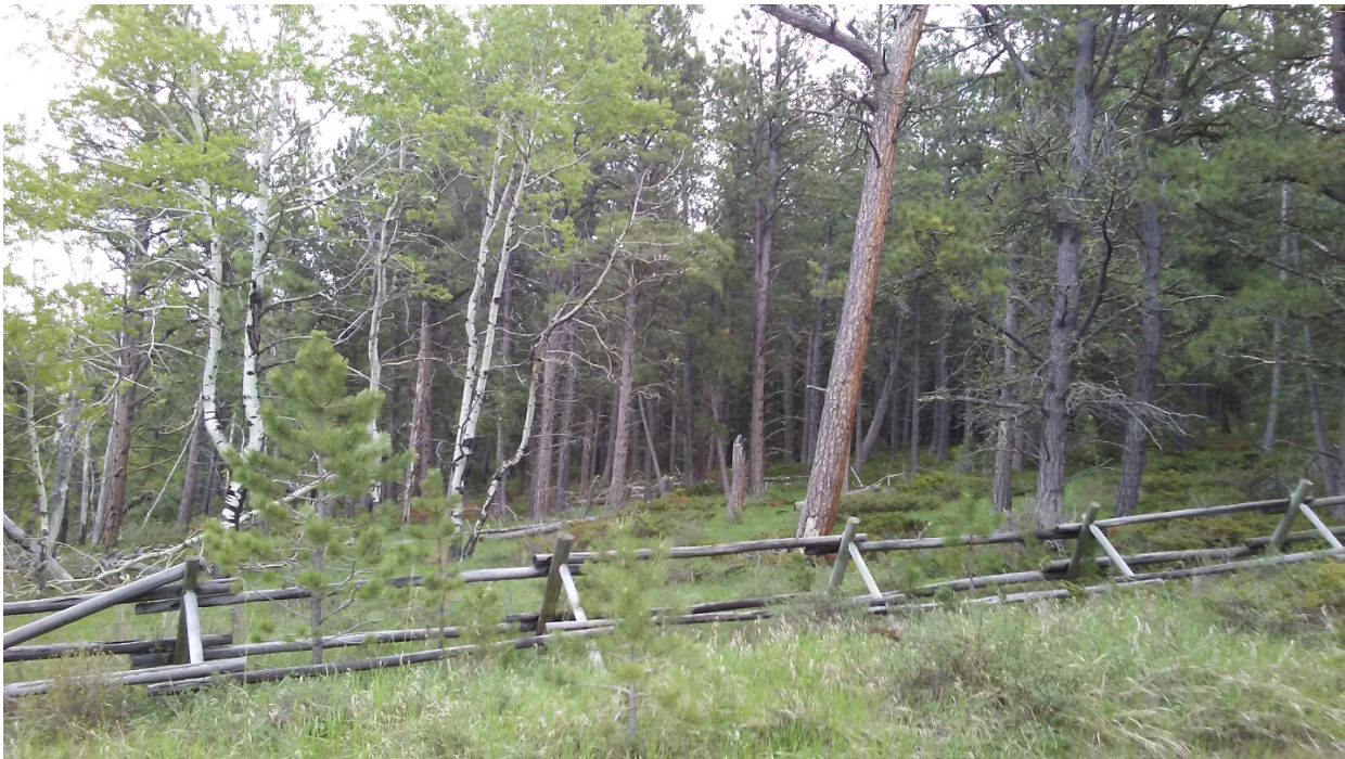
Figure 36. Ponderosa pine and aspen