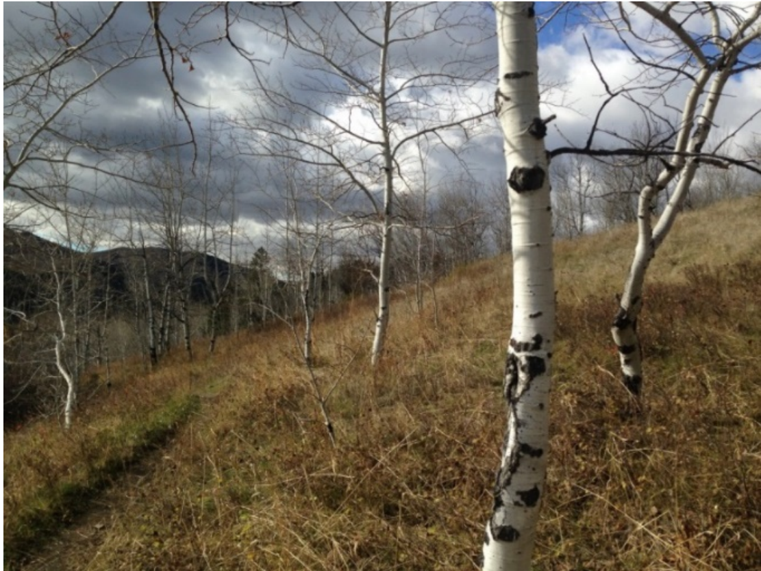
Figure 25. Aspen intergrading with grass