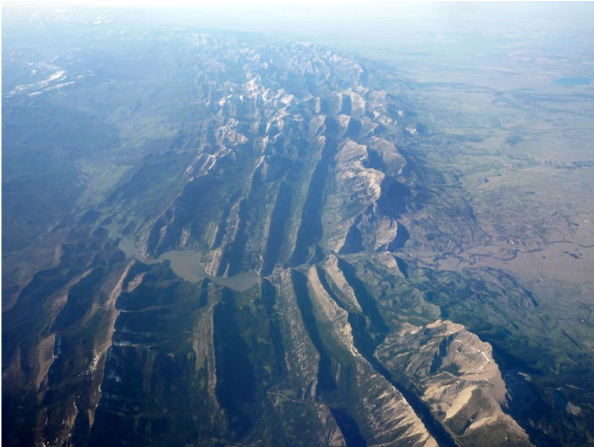
Figure 29. Looking north; west to east: North Fork of the Sun River valley, Gibson Reservoir and the Sun River