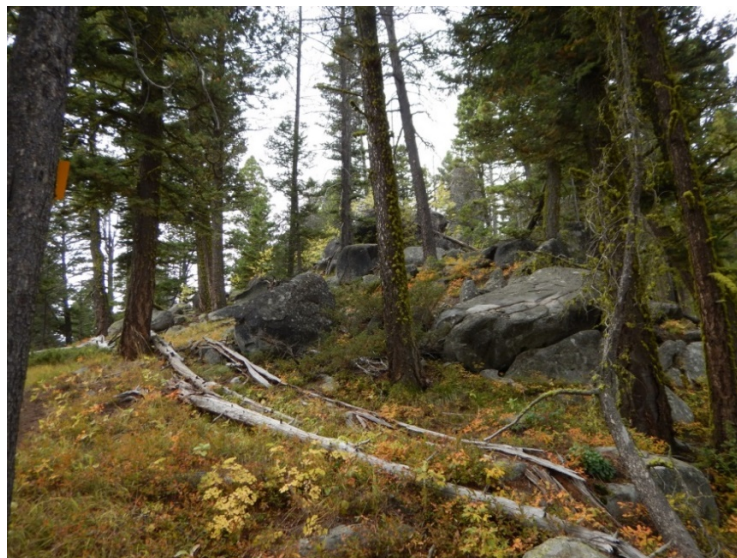
Figure 13. Granite boulder outcrop and fall color along the Continental Divide