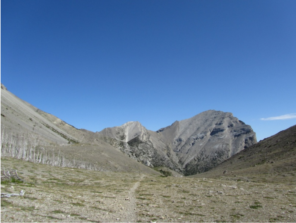
Figure 30. Looking east; Over thrust of carbonate rocks (reef) Sawtooth Range in Blackleaf Canyon