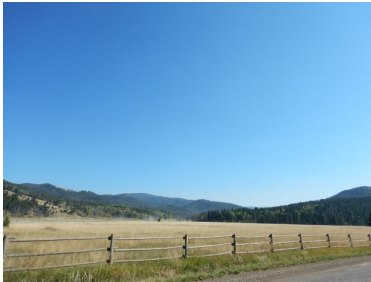
Figure 14. Pasture in the Little Blackfoot Valley, southwest subarea

Landforms are heavily covered in forests of subalpine fir and Douglas-fir habitat types, mostly dominated by seral lodgepole at higher elevations. Talus slopes create openings in the closed canopy of coniferous trees. The most prominent drainage, the Little Blackfoot River, is the largest in the entire GA. It has carved a broad valley bottom and is buffered by robust willow complexes.