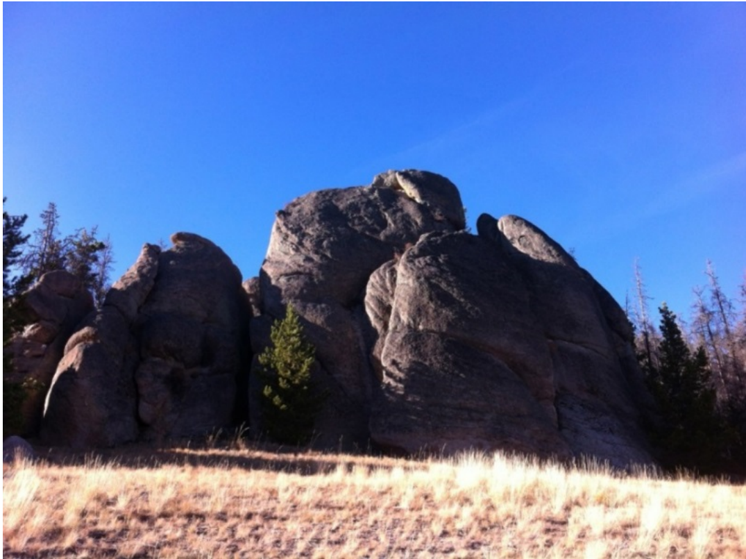
Figure 6. Granite outcrop