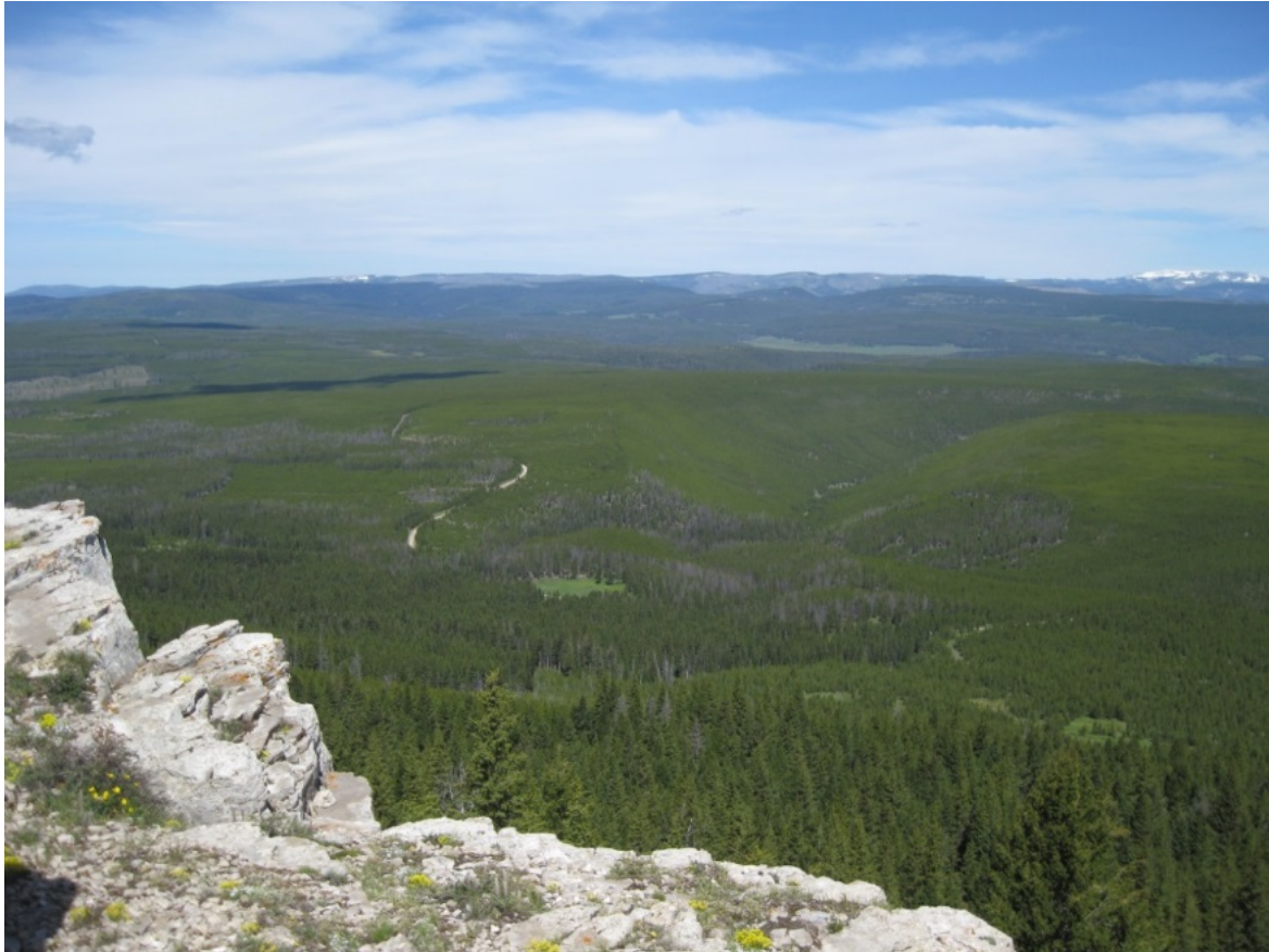
Figure 26. Pierce Park as seen from the slopes of Daisy Mountain with Big Baldy in the background