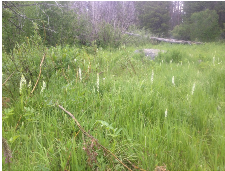
Figure 12. Wet bog along the Continental Divide

Forests are characterized by Douglas-fir and ponderosa pine. Open grasslands occupy south and southwesterly aspects, especially at sun-exposed elevations. The ecoregion to the west is predominantly devoid of trees, creating a stark contrast. Water is scarce here, with only small drainages, Dog Creek being the largest.