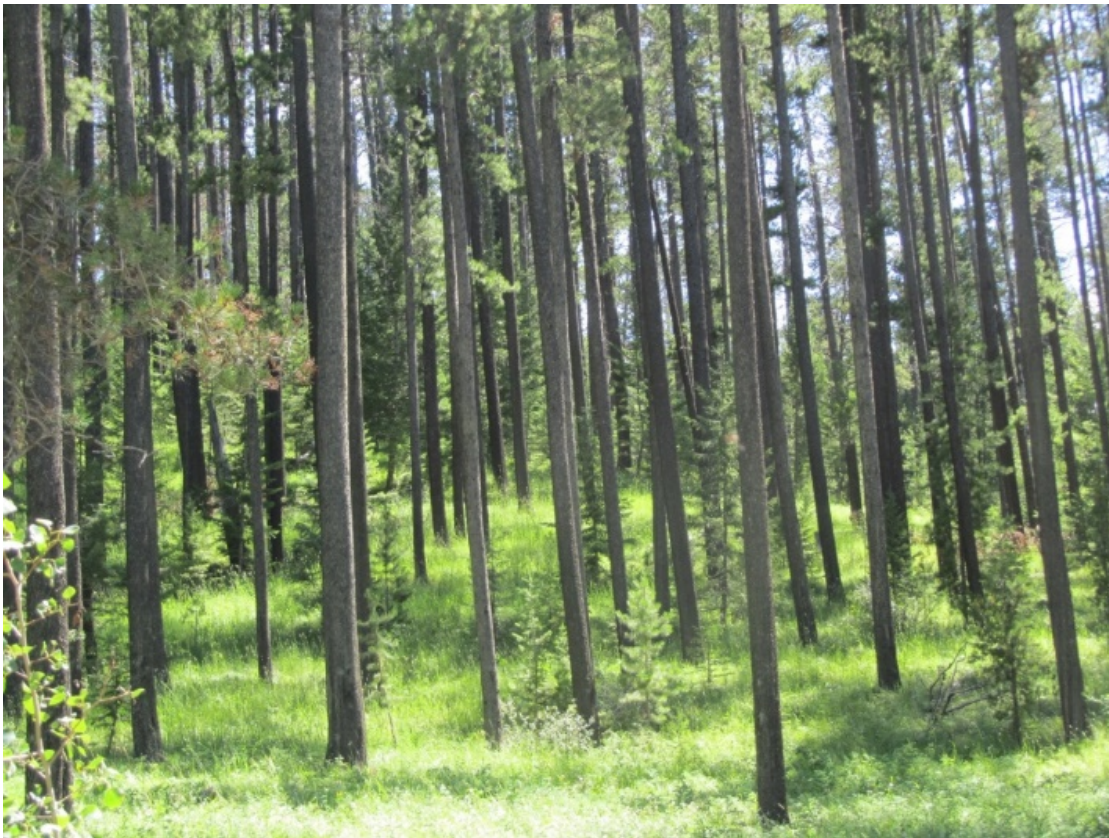
Figure 24. Lodgepole pine stand

The land cover of this GA is a mosaic of conifers, deciduous trees, grass, and rock. Large aspen stands intergrade with rich prairie and dense pine forest. Orderly stands of mature lodgepole pine contrast with more diverse plant assemblages. Open grown Douglas-fir and windswept limber pines add to the diverse character. Woodland, forest, and prairie ebb and flow into one another. Fire was historically the main determinant of vegetative cover.