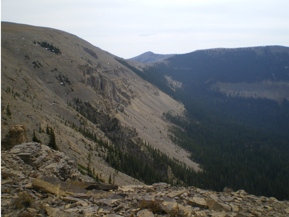
Figure 34. Upper slopes approaching ridgeline