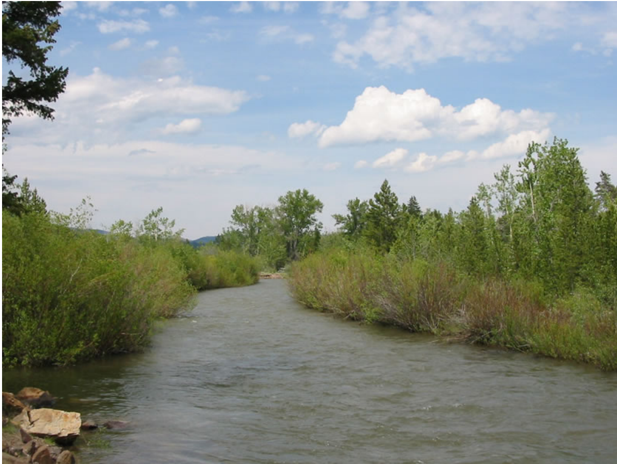
Figure 37. Upper Blackfoot River