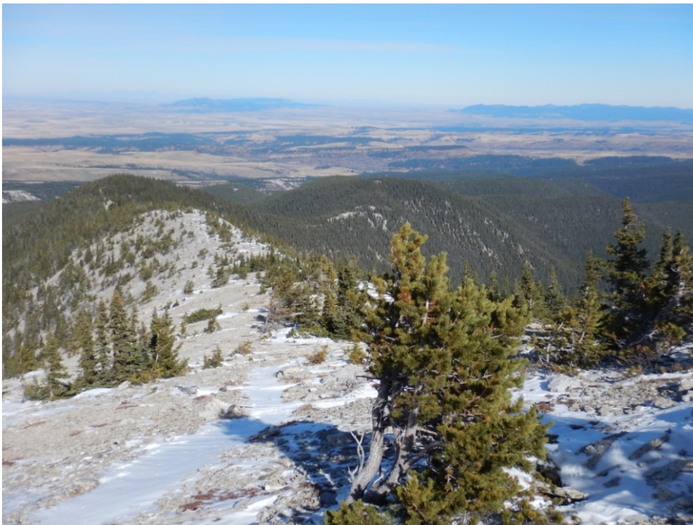
Figure 33. Looking west from the ridge of West Peak

Crystal Lake is one of the Big Snowies' crown jewels. It is a shallow lake of natural origin, roughly 15 feet at its deepest and underlain by a bed of limestone. The GA's karst topography conceals many caves. Floristically, the Big Snowies are unique with many vegetation types compressed into the same area. Greathouse Peak and Old Baldy Research Natural Areas are recognized exemplary examples of dry, alpine plant communities that have been shaped without glaciation but through frost patterning. Fire was the historic driver of plant communities.