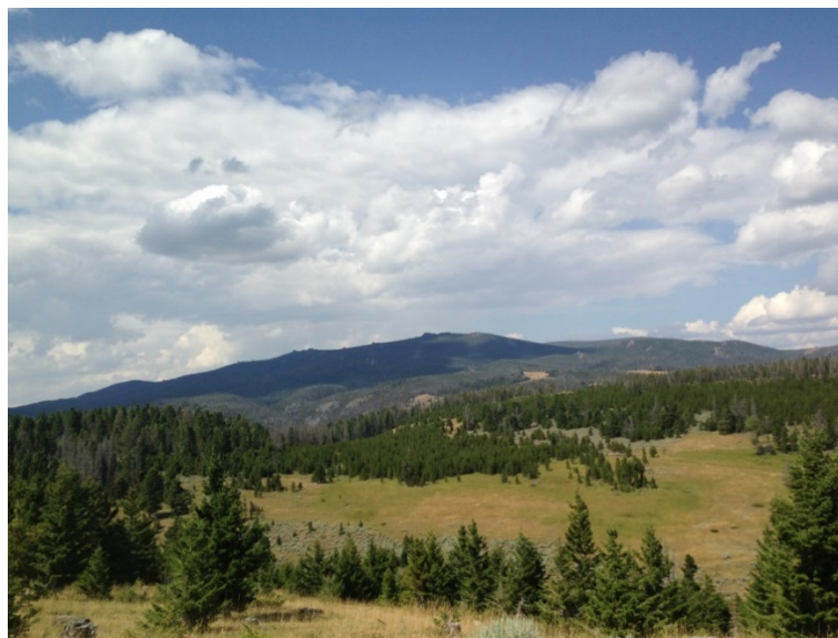
Figure 17. Looking at northeast subarea from foothills of Black Mountain in the southeast subarea