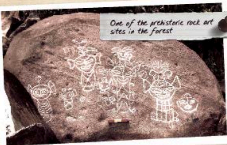
One of the prehistoric rock art sites in the forest

That art consist of images carved into river boulders or rocks inland which we call petroglyphs. Many petroglyphs depict animals, spirits, mythical creatures and worshiped ancestors. They represent not only an artistic expression but are also a representation of the Taino beliefs about creation, life, death, and nature. As such they are sites that once were sacred and extremely important to a past culture.