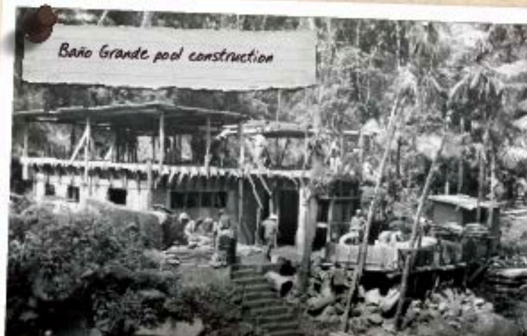
Baño Grande pool construction

If you see something man made in the forest it most likely was built by the CCC. They represent part of our historic legacy. Please enjoy them with respect, do not damage them with graffiti or vandalize them.