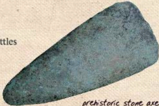
prehistoric stone axe

The El Yunque National Forest has hundreds of archaeological sites and historic resources within its boundaries. They range from prehistoric petroglyphs (rock art) to old homesteaders houses, trash heaps, old mines and all the recreation facilities built during the 1930's by the Civilian Conservation Corp (CCC).