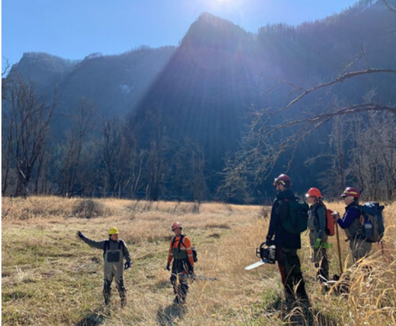
CRGNSA Fisheries Program Manager leads a safety discussion with fallers.

This past February, CRGNSA staff worked in conjunction with the Lower Columbia Estuary Partnership to improve fish habitat in the Horsetail Creek floodplain. The floodplain is located downstream from the falls of the same name, west of Ainsworth State Park , and provides rich habitat for a variety of wildlife species. (Note, it is currently closed to the public.)