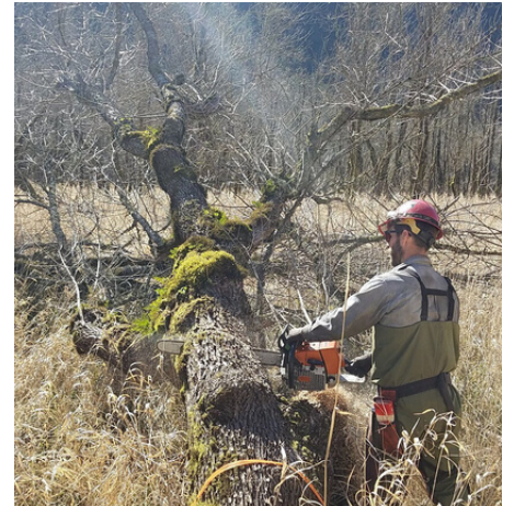
CRGNSA Trails Supervisor bucks up a tree in Horsetail wetlands.

Experienced Forest Service fallers suited up in waders, hard hats and chaps, and felled about 30 standing dead trees that were heavily burned in the 2017 Eagle Creek Fire . The newly downed trees will benefit both adult and juvenile steelhead and coho by increasing habitat complexity. Logs slow the flow of water during high water events, which creates pools that serve as safe places for young fish to grow and stay hidden from predators.