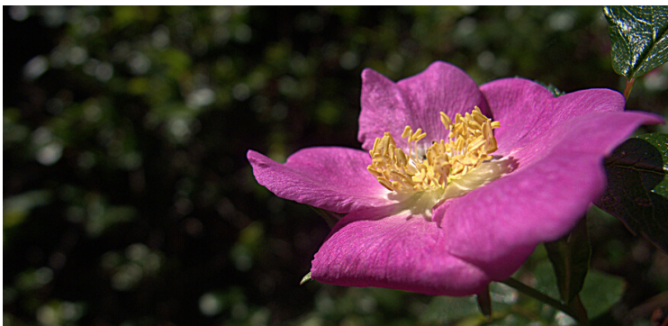
Swamp rose ( Rosa pisocarpa ), one of the native species planted at Sandy River Delta

The Sandy River Delta site is benefiting from a new partnership between the Forest Service and the Bonneville Environmental Foundation (BEF), an Oregon-based nonprofit that protects and restores fish and wildlife habitat. The partnership kicked off with an extensive tree planting at the delta in early March through BEF's Promise the Pod initiative. Forest Service, BEF and Ash Creek Forest Management installed over 46,000 plants in the vicinity of Robin's Woods and Tobie's Woods, including densely planted Pacific Willows to shade out invasive reed canary grass, shade tolerant species such as Oregon Ash and Snowberry , and sun tolerant species in open areas such as Tall Oregon Grape , Mock Orange and Western Crabapple .