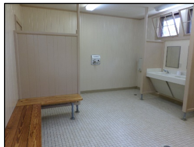
Ratcliff Lake, Davy Crockett National Forest bathhouse floor replacement.

The Davy Crockett National Forest replaced the women's bathhouse floor at the historic Ratcliff Lake Recreation Area. The previous floor had significant water damage. Crews removed the floor, replaced the sub-floor beam and joints, installed the new floor, and repainted the interior walls and stalls. The Forest used approximately $28,000 in recreation fee funds.