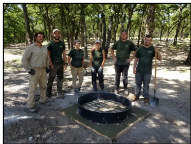
American Youth Works/Texas Conservation Corps installed 11 new fire rings with concrete pads at Black Creek Lake Recreation Area.