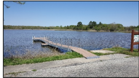
Installation of new floating boat dock at East Lake Crockett.

Lake Crockett is a popular location for boating and fishing. It draws many visitors from the north Texas area as it is a premier lake for crappie fishing. The Forest installed a new floating boat dock at East Lake Crockett to replace one that had long needed repairs. The project cost $19,000 in recreation fee funds.