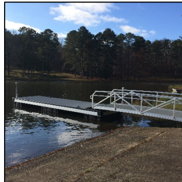
New aluminum, floating dock at Davis Lake Recreation Area, Tombigbee National Forest

Visitors enjoy fishing and boating on the 200 acre lake at Davis Lake Recreation Area. The Forest used $17,000 of recreation fees to remove an old wooden dock and replaced it with an aluminum floating dock at the boat launch. The public can now load boats more easily and safely as the water rises and falls during normal lake fluctuation.