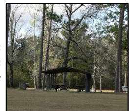
Picnic pavilion after construction assistance

The Seabee Naval Construction Battalion provided 56 volunteer hours to assist the DeSoto National Forest with the construction and replacement of picnic tables, grills, and fire rings at Big Biloxi Recreation Area. The project provided construction experience that helps the battalion troops maintain their construction qualifications. The Forest contributed $3,200 in fees for materials and supplies.