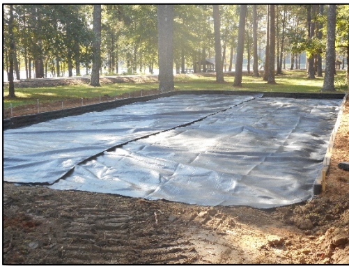
Construction of Volleyball Court

Marathon Lake Recreation Area is a popular destination for visitors on the Bienville National Forest. Facilities include a campground, swimming area, boat launch and hiking trail. In response to visitor interest in playing volleyball, Forest Service employees and the campground host constructed a sand volleyball court. Approximately $3,500 of recreation fees contributed to project materials.