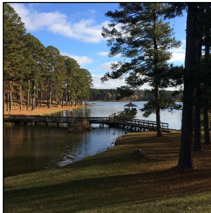
Choctaw Lake Recreation Area, Tombigbee National Forest