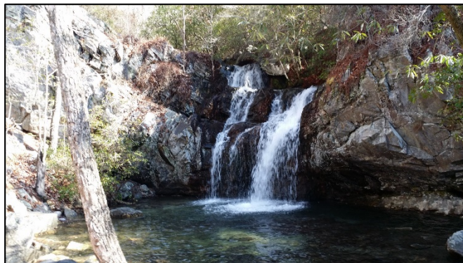
High Falls Waterfall, Talladega National Forest