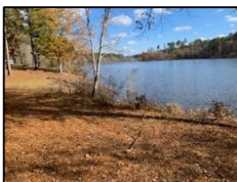
Payne Lake shoreline vegetation reduction