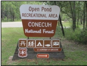
New Entrance sign at the Open Pond Recreational Area

Second, the forest replaced several signs in the area to help share the types of recreational activities available at the area and to guide visitors to those activities.