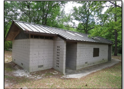
The old bathhouse before it was demolished.

Finally, the forest demolished a bathhouse built in 1968 located in the old swim area. The forest had closed the swim area in 1984, so the bathhouse is no longer in use. Demolition included the removal of the bathhouse, septic system, sidewalks, and other features in order to restore the site to its natural condition.