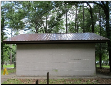
New Metal roof installed on the Open Pond Campground bathhouse.

Open Pond Recreation Area includes a day-use picnic area, campground, and 30-acre lake for boating and fishing. The forest completed three large projects in the area in 2018. First, the campground bathhouse had significant wear to the asphalt shingle roof that caused water to leak around the skylights. This eventually led to rotten and decayed wood along the ceiling. The forest installed a new metal roof, removed the skylights, and replaced all rotten and decayed wood.