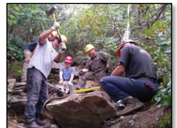
Constructing stone steps on Hawksbill Mountain in the Linville Gorge Wilderness

The Pisgah National Forest completed a number of large trail projects through grants and partnerships. As examples, the Forest made significant improvements on four trails of the Brown Mountain OHV trail system; completed maintenance on 204 miles of trail with the help of volunteers and partners; constructed stone steps in the Linville Gorge Wilderness Area with the help of Wild South; and made improvements to the Kitsuma Trail, a popular bike trail. Recreation fee funds contributed $95,000 to all of these projects.