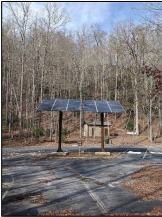
Newly installed solar panels at Sliding Rock

The Forest partnered with Haywood Electric Membership Corporation and installed a new 9,000 watt solar panel system at the Sliding Rock Recreation Area. Sliding Rock is a 60-foot natural water slide that ends in an 8 foot deep pool of water. Open year round, this