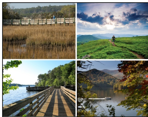
The four National Forests in North Carolina differ greatly in their geography and distinctive beauty, but share in common their unsurpassed recreation opportunities that millions of visitors experience and enjoy.