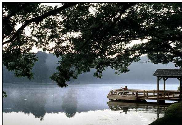
Angler enjoys a misty morning at Sherando Lake.