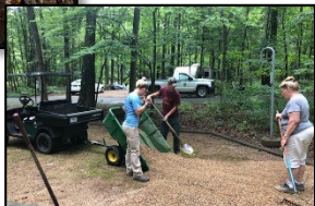
Forest Service employee and volunteers apply new surface material to a campsite