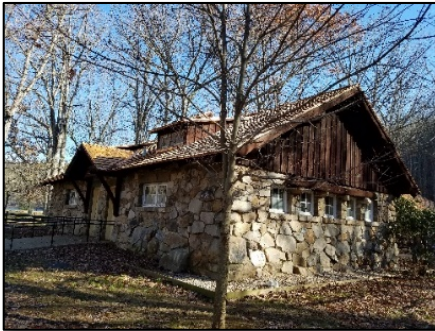
The Sherando Lake Pavilion received a new shake roof

The Civilian Conservation Corps built a now iconic pavilion at Sherando Lake Recreation Area during the Depression. The pavilion houses a picnic shelter, interpretive book store, and a bathhouse. In 2018, the Forest repaired the pavilion's roof, while preserving the original style and materials, to prevent future damage. In addition, the Forest also replaced bathhouse roofs at Raccoon Branch and Stony Fork Campgrounds, and Trout Pond Recreation Area. Recreation fee revenue of $136,000 funded all four roof replacements.