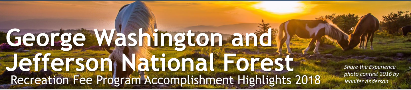
Share the Experience photo contest 2016