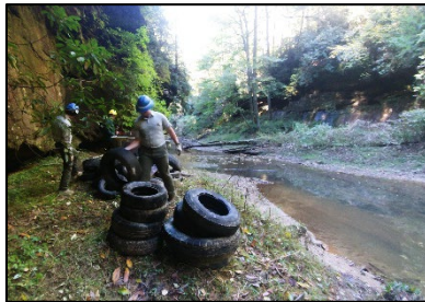
Old tires are staged for collection along Swift Camp Creek

The Red River Gorge Geological Area is noted for its outstanding recreation opportunities. Hallmarks of this area are the Red River and Swift Camp Creek.