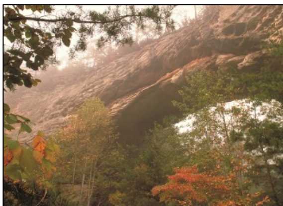
Natural Arch is located on the southern end of the Daniel Boone National Forest