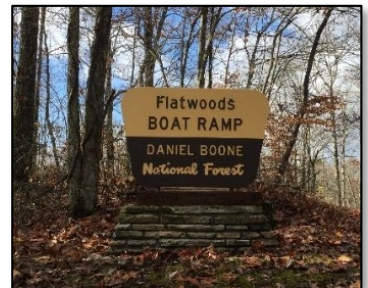
New low-maintenance sign placed at entry to Flatwoods Boat Ramp

Which significantly contributes to our goals of providing consistent and identifiable information for recreational visitors, in the most sustainable manner.