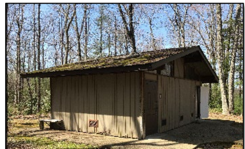
Horse Creek Recreation Area bathroom

Horse Creek Recreation Area, located in the shadow of Cold Spring Mountain, offers picnicking, camping and many hiking opportunities. In 2018, the Forest committed $65,000 in recreation fee funds for an early 2019 bathroom project that will reduce deferred maintenance and have the bathroom in good shape before the site opens.