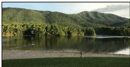
Fee revenue paid to restore the fishing point at Indian Boundary Lake, as well as rebuild several campsites following damage from a winter storm.