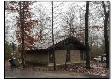
Bathroom of Chilhowee Recreation Area

These new roofs, which cost $101,000 in recreation fee funds, will prevent water leaks and structural damage for decades to come.