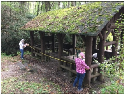
Architects taking field measurements on the CCC-built arbor at Dam Creek

In order to preserve the legacy of the Civilian Conservation Corps (CCC), the Forest is working with local environmental and architect companies to produce historical narratives, detailed drawings, and repair recommendations for seven CCC-built structures. Most of these 1930's structures are timber-framed picnic shelters. Others are an arbor at Dam Creek and a stone gazebo on the brim of Oswald Dome. This work, at a cost of $52,000 of recreation fee funds, will help the Forest retain the sites' historical integrity when making repairs, and may make them eligible for the National Register of Historic Places.