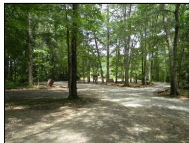
Oconee Ranger District Recreation Site

Recreation fees paid for the daily upkeep of 14 day use areas and 21 campgrounds. The Forest spent about $112,000 on activities like cleaning, mowing, plumbing, pumping toilets, updating signs and purchasing equipment and supplies.