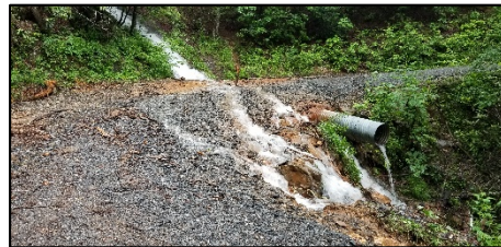
Chattooga River Ranger District Road Repairs

The Forest collects permit fees from outfitter guides and recreation event organizers to more efficiently administer and process permits. Funds also allow the Forest to better monitor permitted activities and prevent illegal ones. These permit holders provide incredible opportunities for visitors who are looking for challenging events or knowledgeable guides. In 2018, the Forest invested $115,000 to better manage permits and increase patrols on weekends, holidays and during special events. In addition, the Forest improved 46 miles of roads used by these permit holders by blading, cleaning drainage structures, and filling in potholes using 2,000 tons of aggregate.