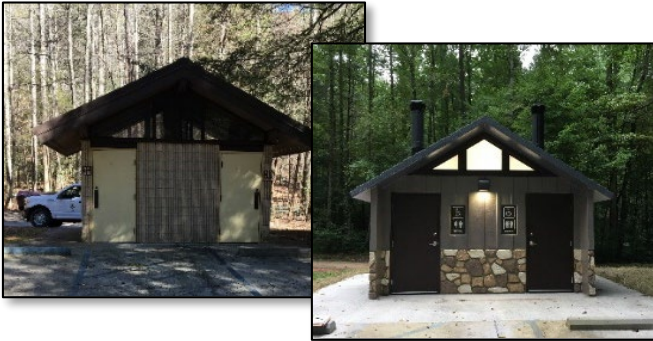
Before and after installation of new vault toilets

Tallulah River Campground lies on its namesake river at the base of the Appalachian Mountains at 2,080 feet. Its location makes it a popular destination for campers and anglers. This campground has 16 large, graveled RV and tent sites, each with picnic tables, grills and lantern poles, all in a wooded setting. To improve this campground, the Forest used $63,000 in recreation fee funds to demolish two malfunctioning toilet buildings and replaced one of them with a lighted double vault toilet.