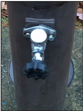
New water spigots replaced worn, damaged, and leaking versions in many campgrounds.