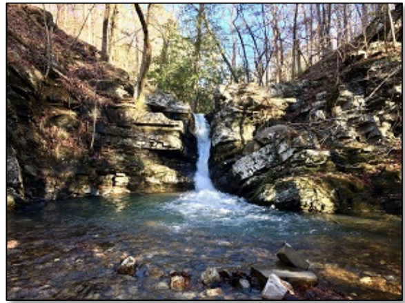
One of the many waterfalls that gush after a rain event .