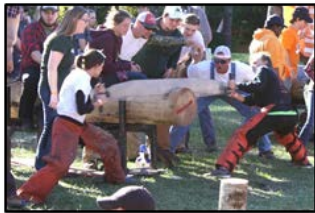
Forest Festival Day cross-cut saw competition.

first school of forestry. Over 400 people were invited to this celebration of the beginnings of American Forestry. Today we commemorate Schenck's Forest Fair along the 1-mile Forest Festival Trail and annual Forest Festival Day where traditional craftsmen, exhibitors, forestry students, and entertainers are invited to present their skills and craftsmanship. Approximately $2,000 of Recreation Fee dollars were used.