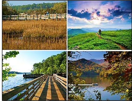
The Forests differ greatly in their geography and distinctive beauty, but share in common their unsurpassed recreation opportunities that millions of visitors experience and enjoy.