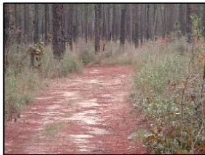
Little Tiger ATV trail