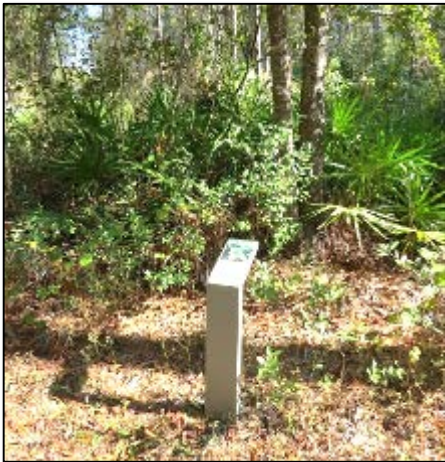
Plant identification signage for a trail at Ocean Pond Campground.

The Youth Conservation Corp, a program designed to help teenagers gain summer employment with the Forest Service, researched and developed a signage plan for a plant identification trail at Ocean Pond Campground. The forest used about $10,000 of Recreation Fee funds to improve the trail.