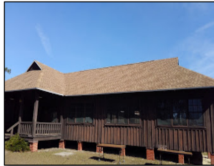
Doe Lake Group Campground dining hall after roof repair

The Doe Lake Group Campground is one of the most popular group areas for the forest. Hunters, campers, equestrian groups and other visitors use the campground's spacious dining hall for general gatherings, weddings and meetings. The forest used $40,000 of recreation fee dollars to replace the roof which should last for many years.