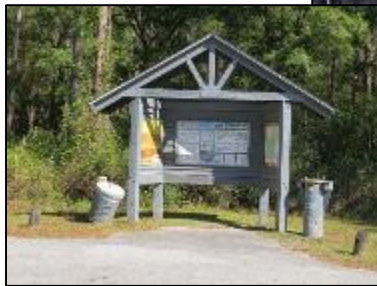
New information board.