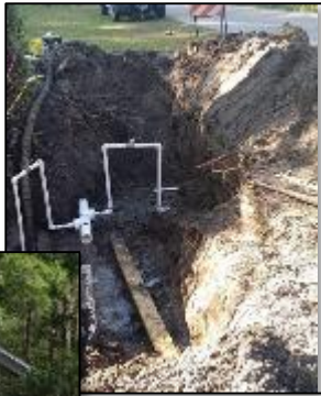
Ocean Pond Campground water system line repair.