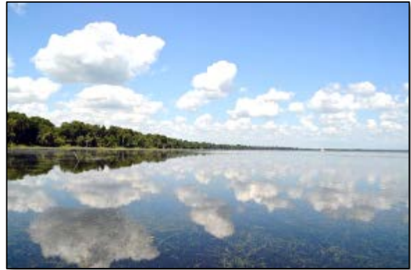
Lake George, Ocala National Forest