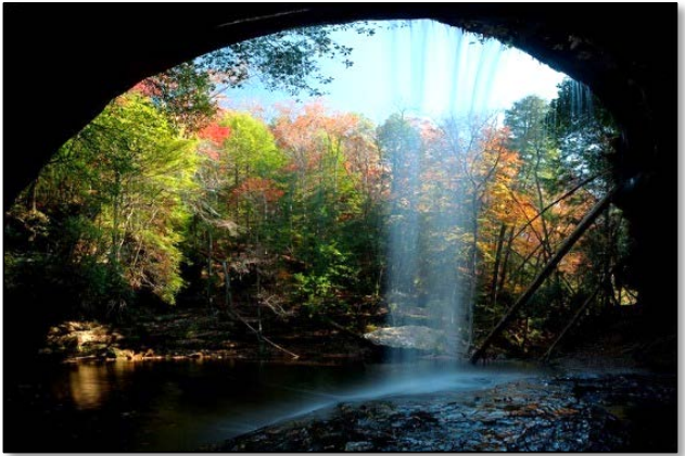
Beautiful Waterfall in the Sipsey Wilderness