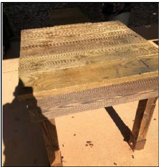
New tables at Uchee Shooting Range