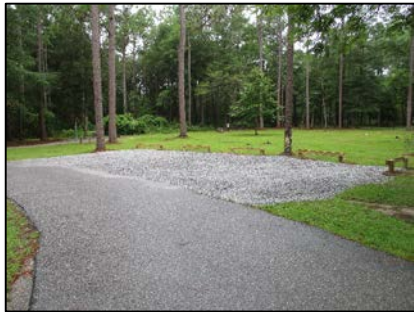
New parking area

The two new parking areas will reduce impacts to campers when they have multiple vehicles and/or guest visiting. They will also help reduce the number of vehicles parking along the road edge and make roadway passage safer for campers and motorhomes. Finally, the new areas will help with area degradation. Recreation fee dollars of $1,884.47 helped to fund this project.