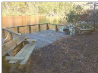
Accessible fishing pier and benches at Trout Pond