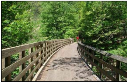
One of 38 trestles visitors cross between Whitetop Station and Damascus on the Virginia Creeper National Recreation Trail

The Virginia Creeper was once a line of the Norfolk & Western Railway. It was thought to be the steepest railroad grade in the eastern United States. Today it is a National Recreation Trail (NRT) and has been inducted into the Rail-Trail Hall of Fame.