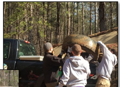
Hauling trash to the dump during the 5th Annual Chattooga River Sweep.