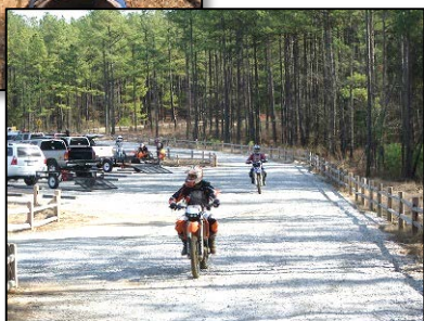
Riders at the Enoree OHV Trailhead delineated by split rail fencing.