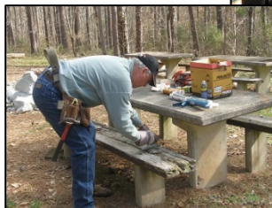
Repairing picnic table benches.