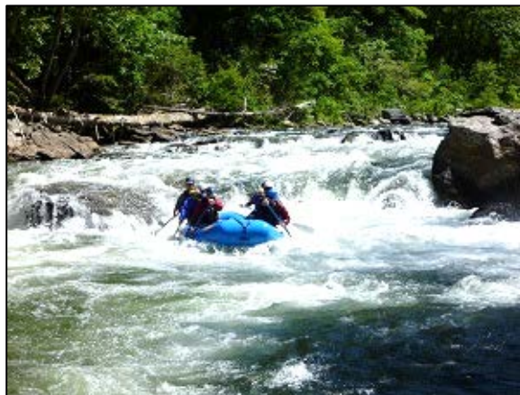
Rafting the Chattooga National Wild and Scenic River.