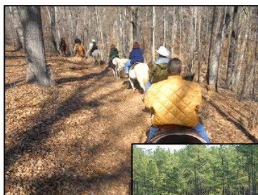
Horseback riders enjoying the Woods Ferry Horse Trail.