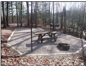
Rebuilt campsite at Koomer Ridge Campground