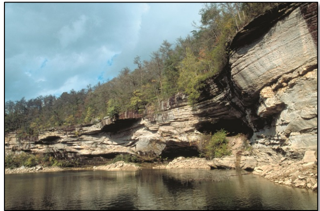
Laurel Lake Near Craig's Creek