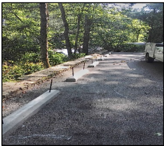
Dudley Falls parking area - rock repair and new bumper guards