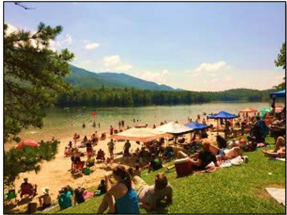
2017 solar eclipse crowd Indian Boundary Recreation Area