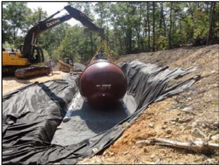
20,000 gallon water tank installation as part of the water system replacement

In addition the forest relocated a faucet in the day use area and plans to install an exterior shower near the swimming area. The project used over $40,000 in recreation fee revenues as well as $160,000 in other funds.