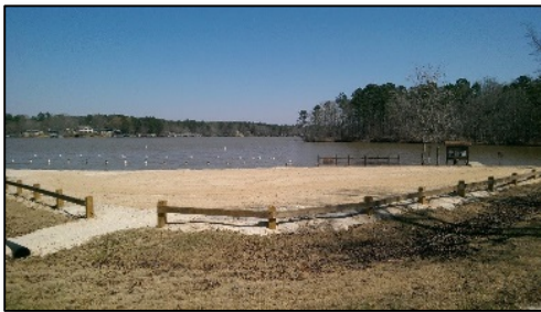
New sand at the Lake Sinclair Recreation Area