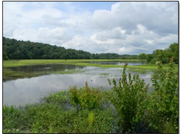
60 acre freshwater wetland created to provide healthy and sustainable waterfowl habitat