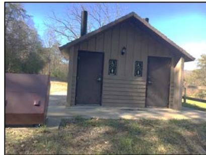
Satterfield Trailhead at Beasley Knob OHV Area

Satterfeild Trailhead is one of two sites that provide access to Beasley Knob OHV Area, which is a popular destination for four wheel drive vehicles, AVTs/UTVs and dirt bike riders.