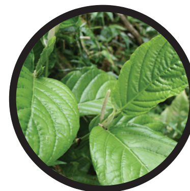
HIGUILLO OLOROSO Piper glabrescens