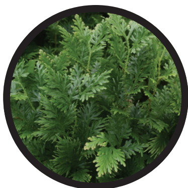
ASIAN SPIKEMOSS Selaginella plana