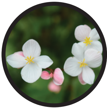
BEGONIA Begonia degandra