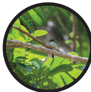
SAN PEDRITO Todus portoricensis