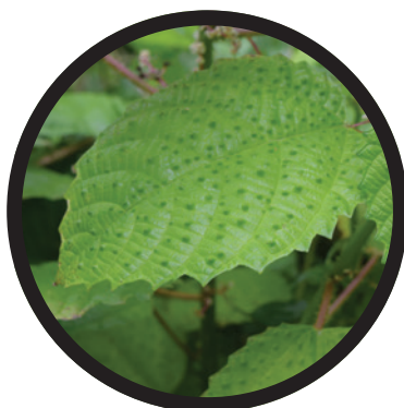
STINGING NETTLE Urea baccifera