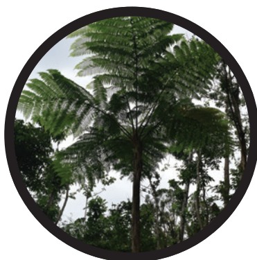
HELECHO GIGANTE Cyathea arborea