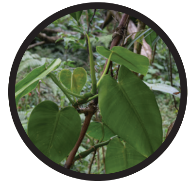
BEJUCO DE CALABAZÓN Philodendron consanguineum

For more images of the species, you can go to: floraerverde.catec.upr.edu