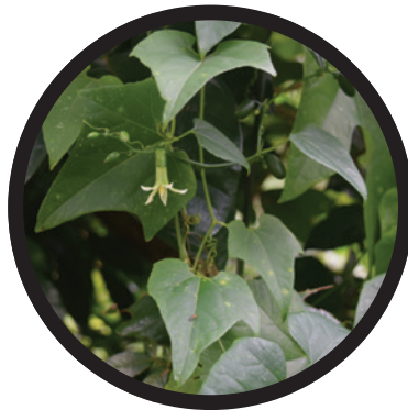
AMERICAN MELONLEAF Cayaponia americana