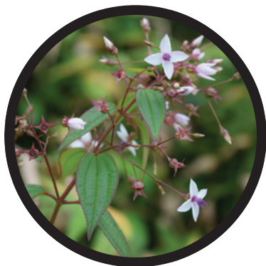
CAMASEY DE CIÉNAGA Nepsera aquatica