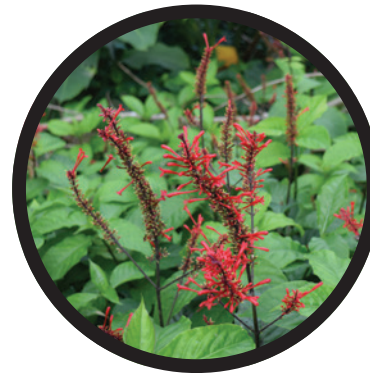
CARDINAL'S GUARD OR FIRESPIKE Odontonema cuspidatum