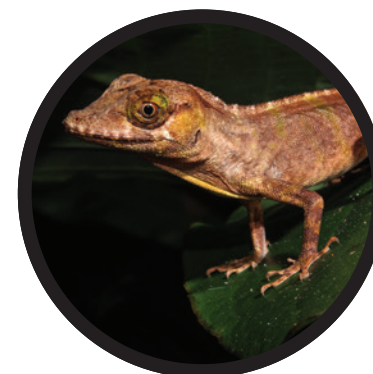
CUVIERI Anolis cuvieri

CAUTION : Be careful with the Ortiga Brava (Stinging Nettle). Touching it causes stinging pain, inflammation, and a burning sensation. Avoid touching them to prevent accidents.