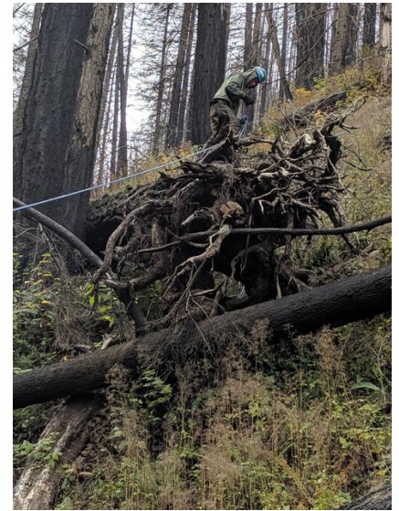
Rigging rootwad for removal