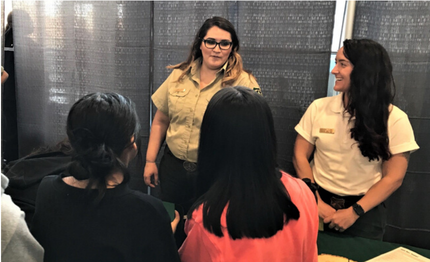
Staff interacts with students at college fair