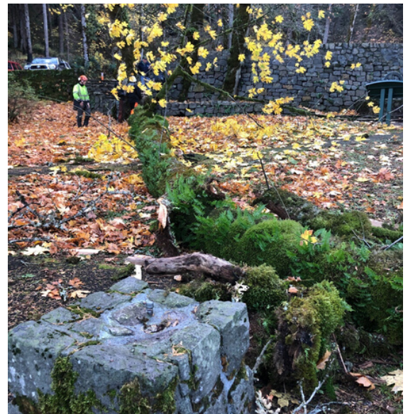
Hazard tree felled at Wahkeena Picnic Area

Our crews have also been removing hazard trees and limbs from recreation sites. Hazard trees are trees with structural defects that make them likely to fall, so our policy is to remove them at sites where people rest or congregate, such as picnic areas.