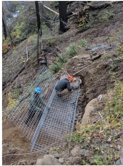
Restoring trail tread with gabion

A crew of veteran trail workers from North Cascades National Park has been working on trails impacted by the Eagle Creek Fire. This is year two of an agreement we have with the National Park Service to help with complex log-out operations. They've been rebuilding damaged sections of Horsetail and Oneonta Trails. Their experience in the forested river valleys of the North Cascades is valuable in the Gorge's post-fire landscape, as they use elaborate rigging systems to remove massive tree trunks and snarled root wads from the trail.