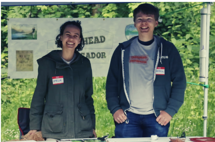
Trailhead ambassadors at Latourell Falls State Park