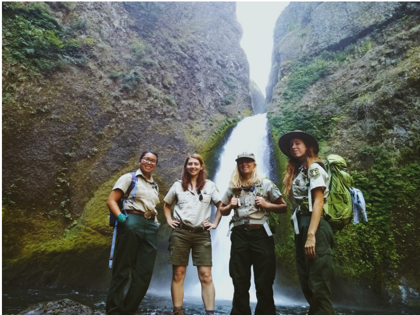
It was a team effort to reopen Wahclella Falls Trail this week