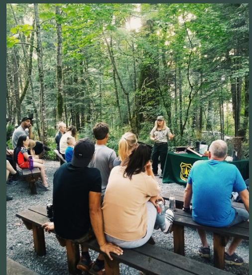
Field rangers host a program on wildland fire ecology at Eagle Creek Campground