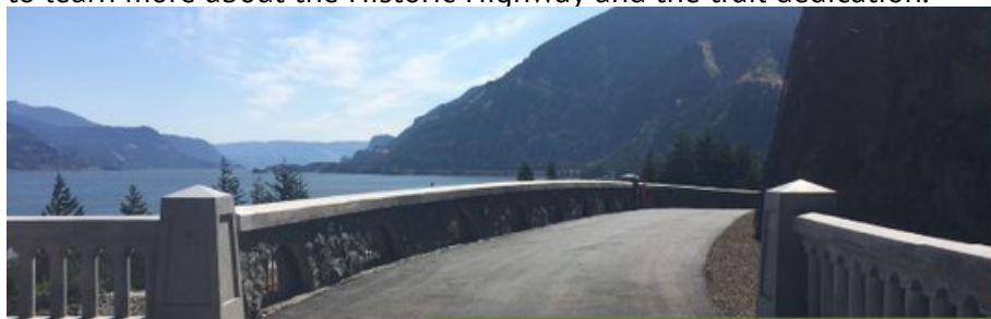
The new Historic Highway State Trail segment will pass vistas such as this, en route from Wyeth to Starvation Creek

Partners include OR Department of Transportation, OR Parks and Recreation, OR State Historic Preservation Office, Hood River County, U.S. Forest Service and Travel Oregon. Visit www.historichighway.org to learn more about the Historic Highway and the trail dedication.