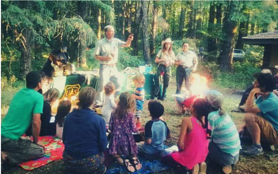
Captive audience at the Wyeth Campground program