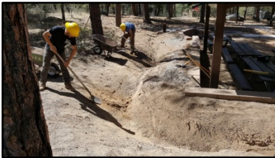
Arizona Backcountry Horsemen do work to control erosion at Groom Creek Horse Camp