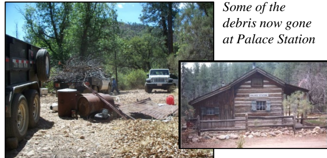
Some of the debris now gone at Palace Station

The Forest worked with the Yavapai County Education Service Agency, AmeriCorps and the Youth Conservation Corps to improve Palace Station, a historic stage coach stop. Putting in over 320 hours, the crews removed over 6,000 pounds of debris, metal and trash from the site. Amounting to about $50,000 of work, this clean-up effort helped prepare Palace Station to become a cabin rental.