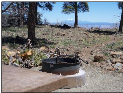
Mingus camp site

Mingus Mountain Campground has been in a continuous 'lightning storm' battle with nature and has been losing ground, but made great strides in 2018. A lightning impact specialist refurbished the electrical and repaired the water systems to withstand direct hits. The campground now has water through a water hauling service, but electrical work is still needed. Future improvements and conversion to the reservation system will occur in 2019. Recreation fee funds contributed about $105,000 while appropriations contributed $62,000 to this work.